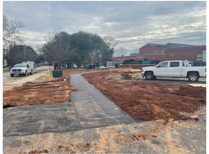
New walking path is in progress.