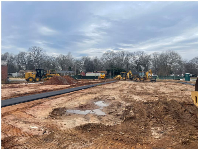
New walking path is in progress.