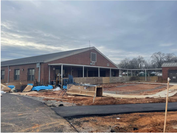
New asphalt and concrete paving is in progress.