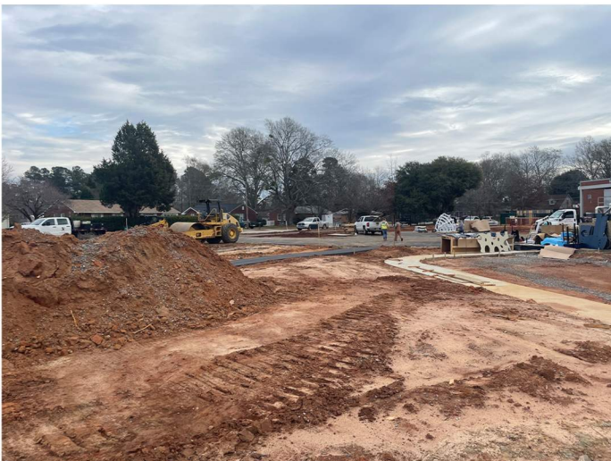
Exterior progress photo.