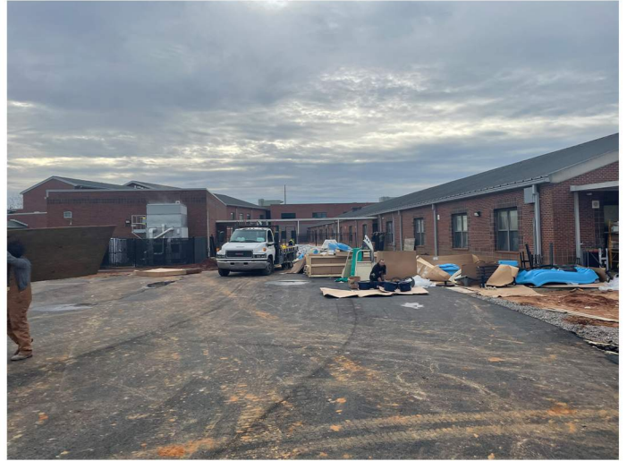
New fire access drive and fencing are in progress.