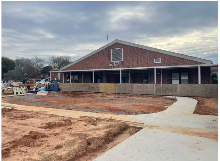
Kindergarten tricycle path has been installed.