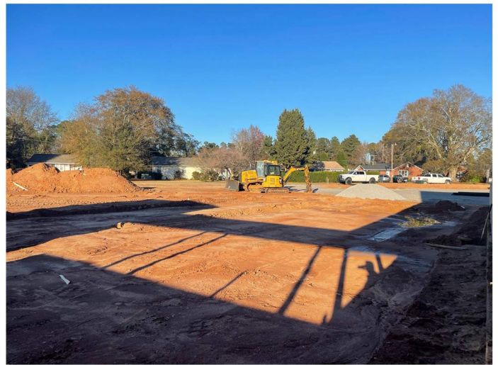
Exterior progress photo.