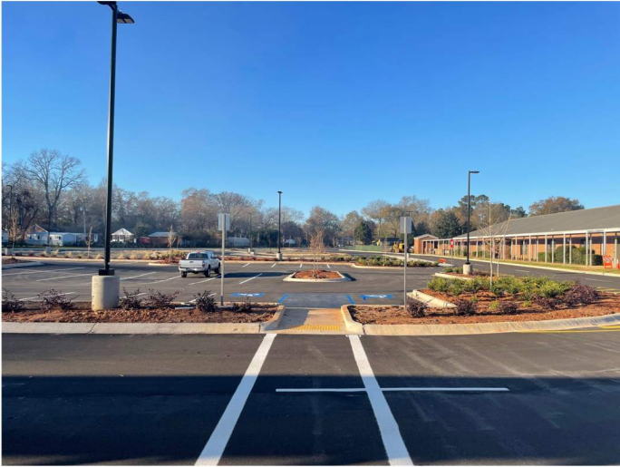
Striping is complete and landscape is in progress.