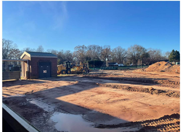
Exterior progress photo.