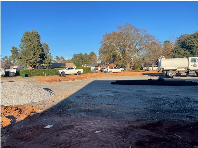
Exterior progress photo.