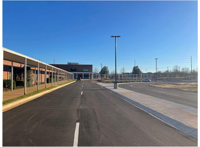
Exterior progress photo.