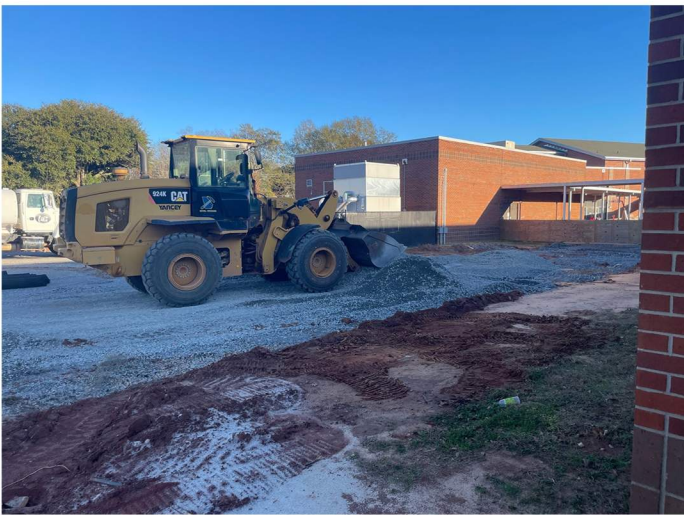
Base course installed for new fire access road.