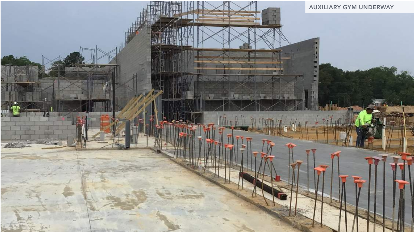
AUXILIARY GYM UNDERWAY