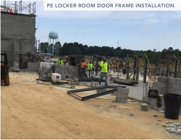
PE LOCKER ROOM DOOR FRAME INSTALLATION