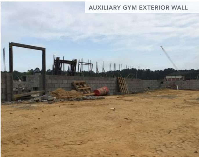
AUXILIARY GYM EXTERIOR WALL