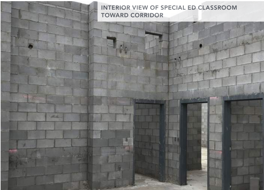
INTERIOR VIEW OF SPECIAL ED CLASSROOM TOWARD CORRIDOR