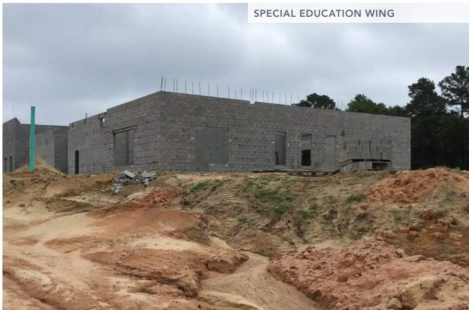
SPECIAL EDUCATION WING