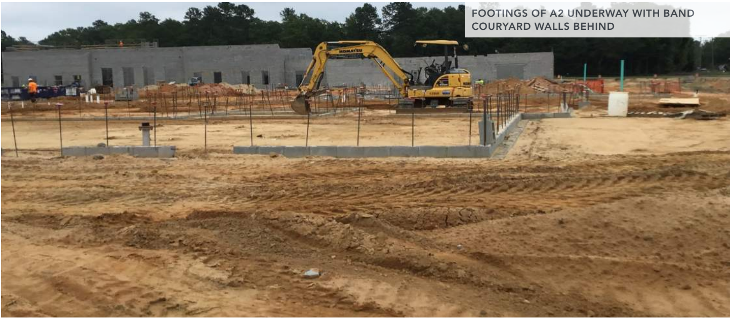
FOOTINGS OF A2 UNDERWAY WITH BAND COURTYARD WALLS BEHIND