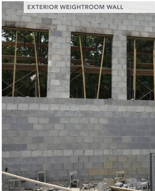
EXTERIOR WEIGHTROOM WALL