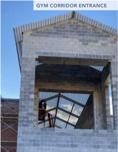
GYM CORRIDOR ENTRANCE