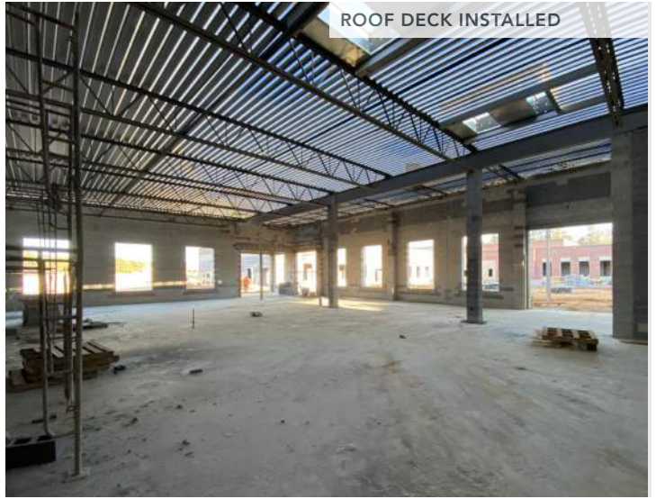
ROOF DECK INSTALLED