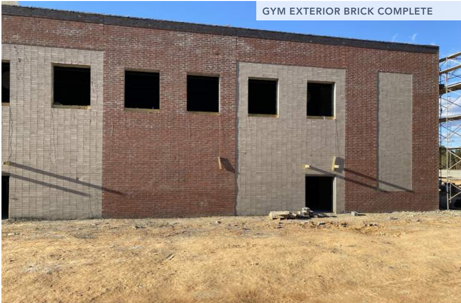
GYM EXTERIOR BRICK COMPLETE