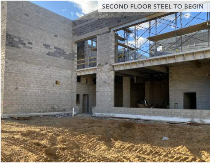
SECOND FLOOR STEEL TO BEGIN