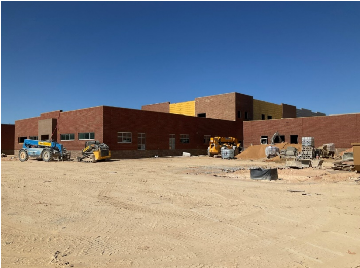
South Elevation [09.27.2022]