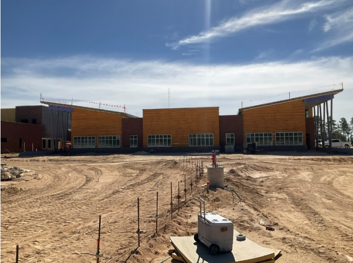
North Elevation [09.27.2022]