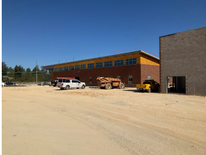
West Elevation [09.27.2022]