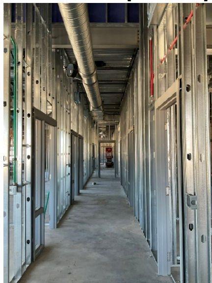
Area "A" Administration [09.27.2022]