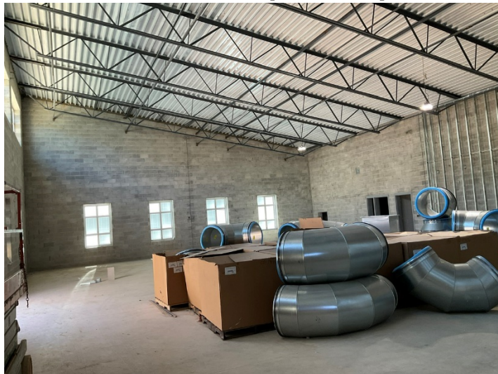
MS Media Center [09.27.2022]