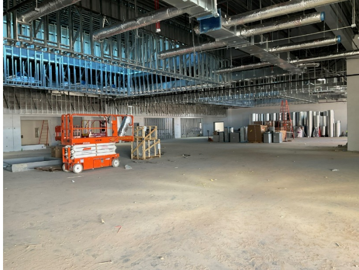
Area "E" Dining [09.27.2022]