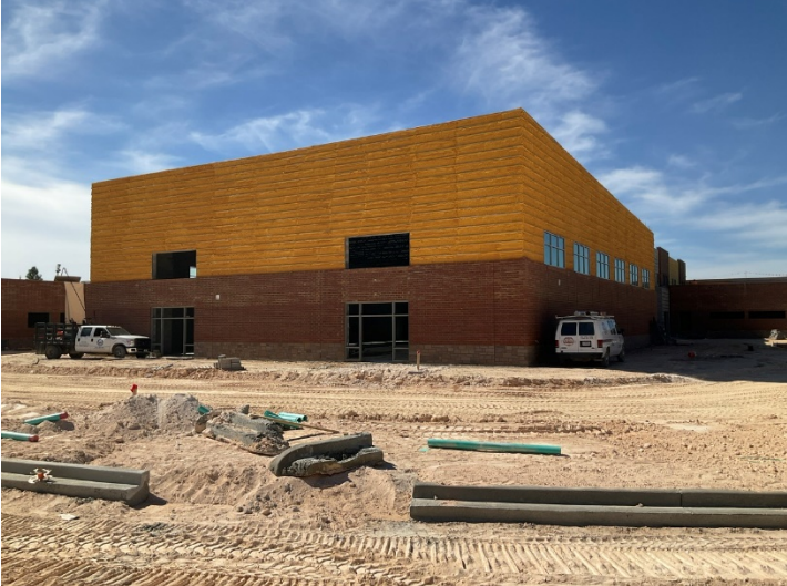
East Elevation [09.27.2022]