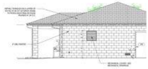
EAST ELEVATION 02-11-22