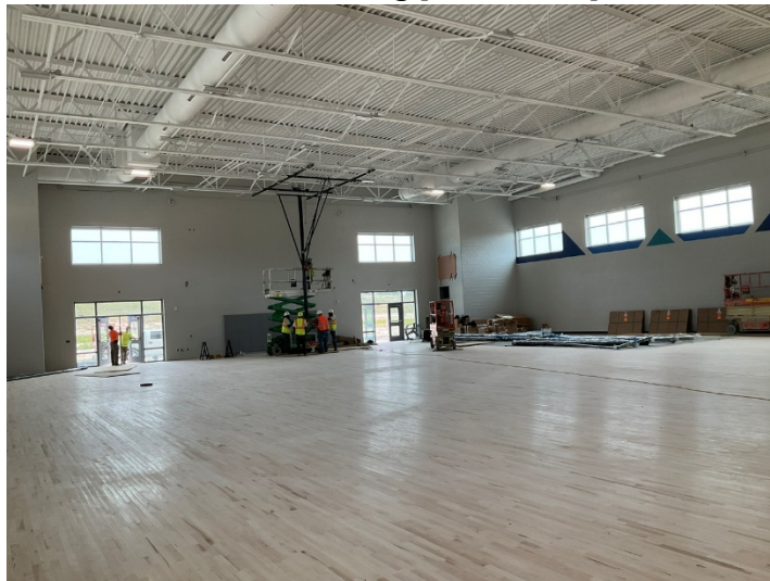
Area "B" Gym [05.24.2023]