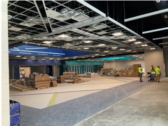
Area "E" Dining [05.24.2023]