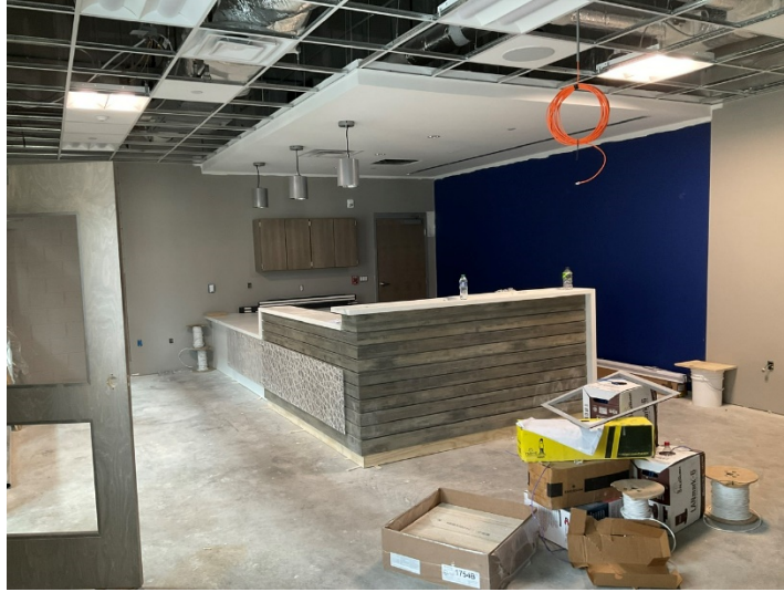
Area "A" Administration [05.24.2023]