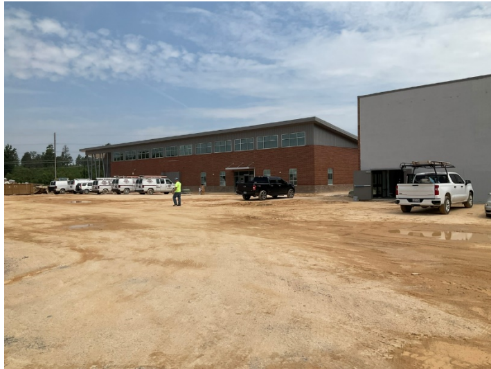
West Elevation [05.24.2023]