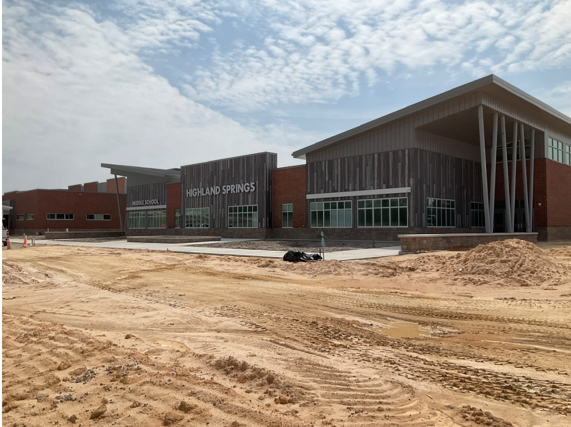
North Elevation [05.24.2023]