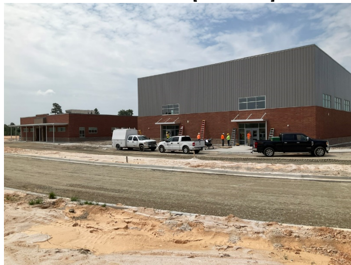
East Elevation [05.24.2023]