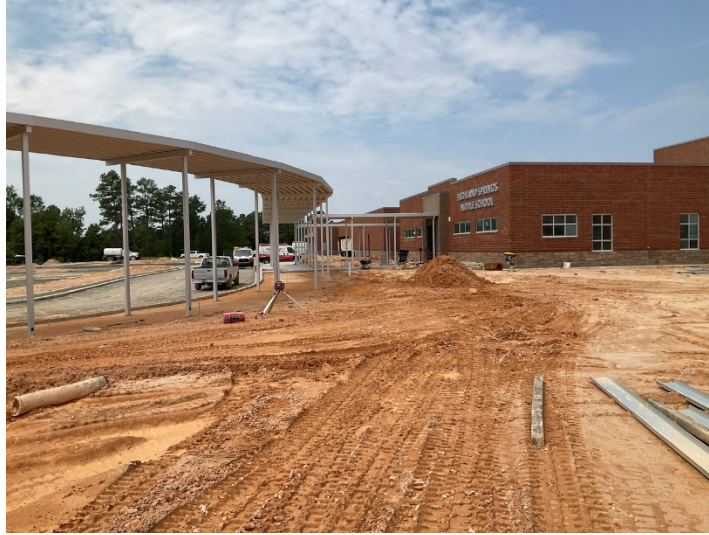
South Elevation [05.24.2023]