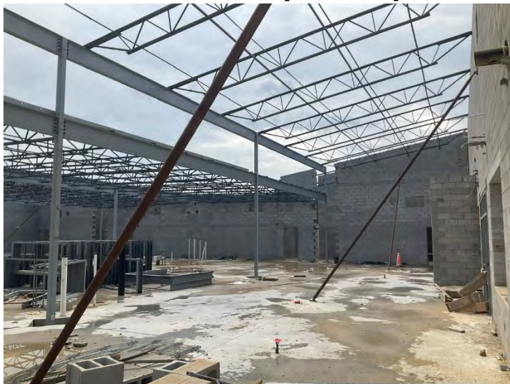
Area "A" Administration [07.19.2022]