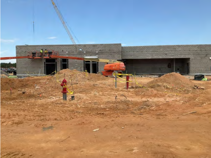
South Elevation [07.19.2022]