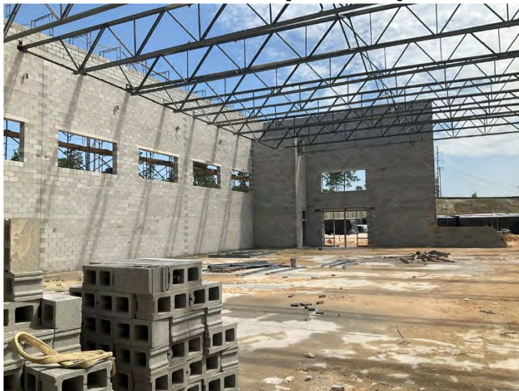
Area "B" Gym [07.19.2022]