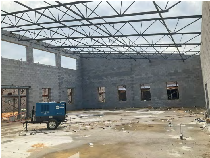
MS Media Center [07.19.2022]