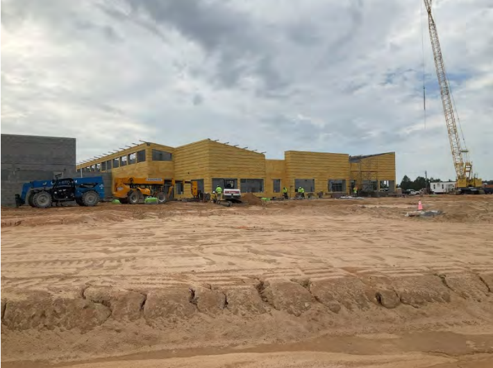
North Elevation [07.19.2022]