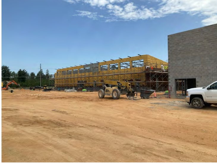
West Elevation [07.19.2022]