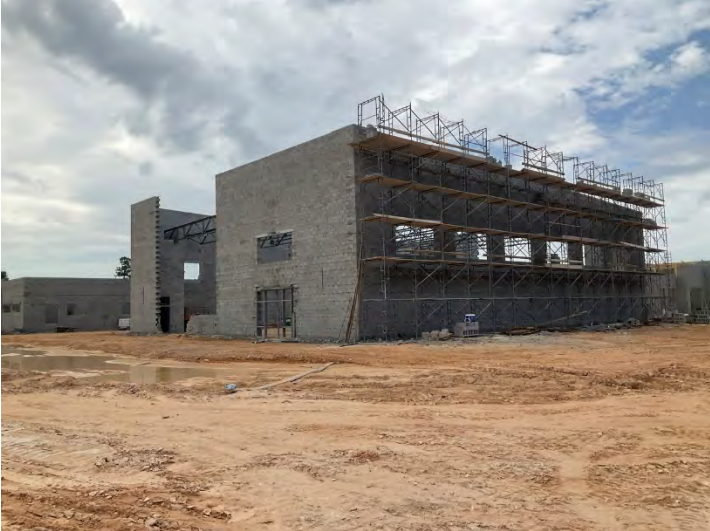
East Elevation [07.19.2022]