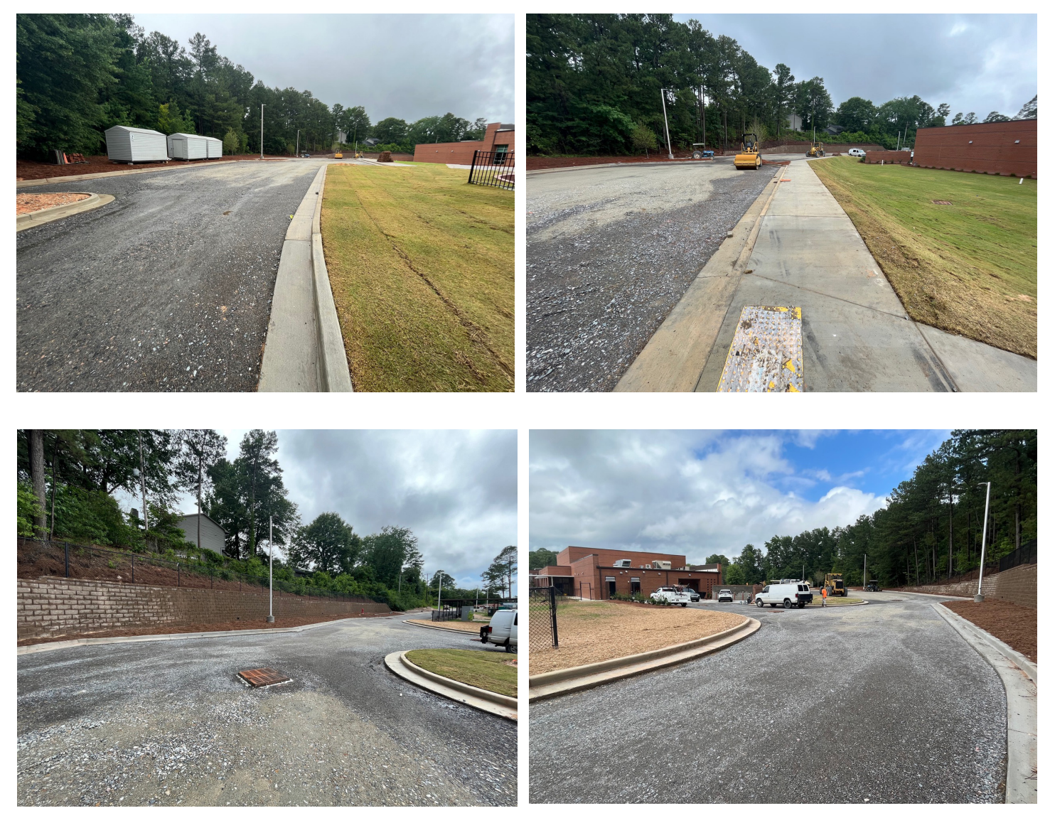
PHASE 2 SITE WORK PROGRESS