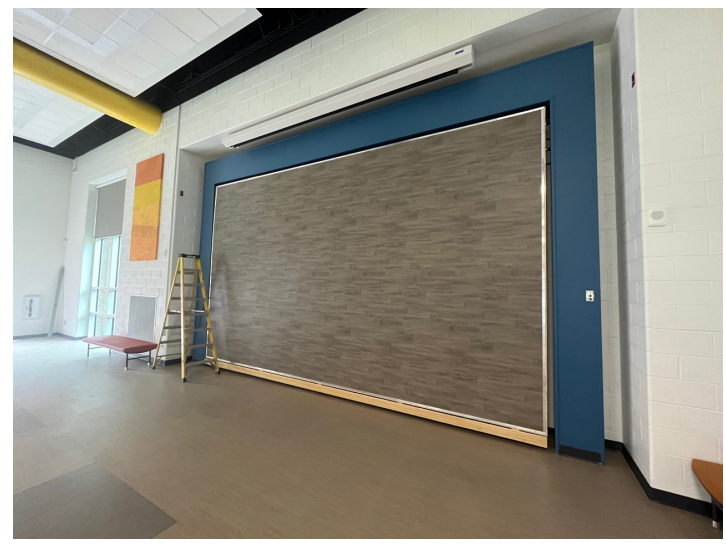
FINISH FLOORING INSTALLED ON RETRACTABLE STAGE.