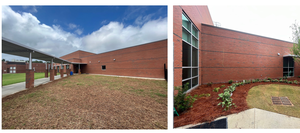
PHASE 2 BUILDING PROGRESS