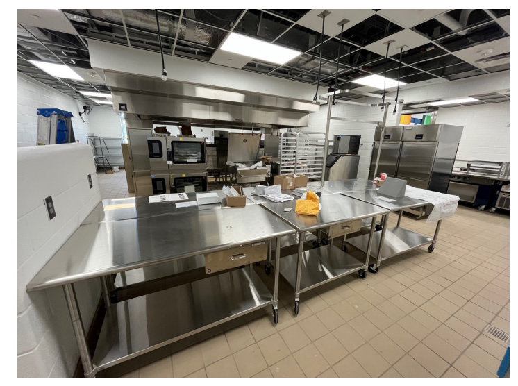
KITCHEN EQUIPMENT INSTALLATION COMPLETE. UTILITY CONNECTIONS IN PROGRESS.