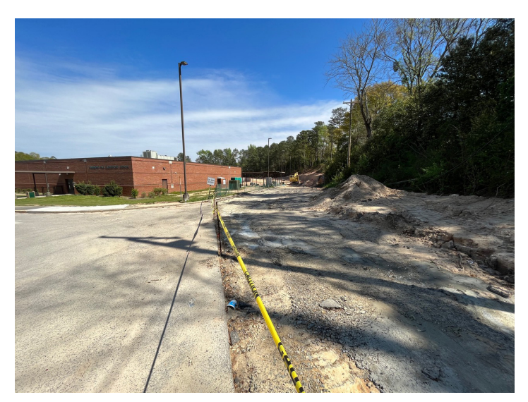
EXISTING ROADWAY BEING WIDENED.