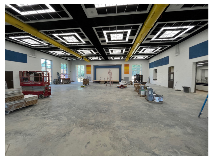
PHASE 2 INTERIOR CONSTRUCTION PROGRESS