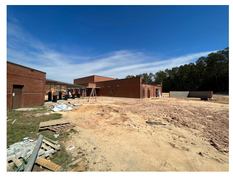
PHASE 2 EXTERIOR CONSTRUCTION PROGRESS