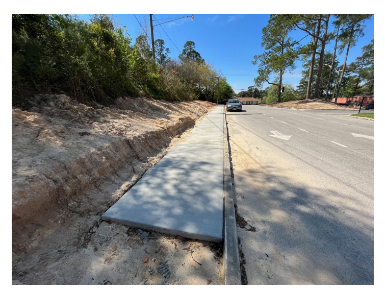
NEW SIDEWALK FROM WOODLAWN AVE. POURED.