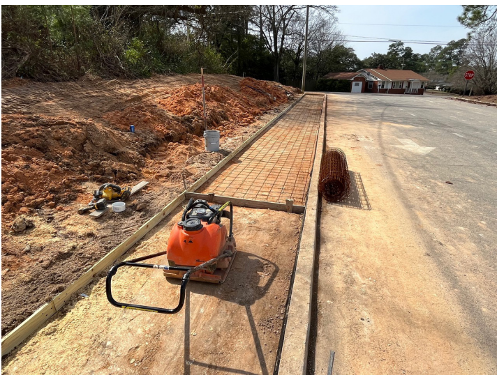
NEW SIDEWALK FROM WOODLAWN AVE.