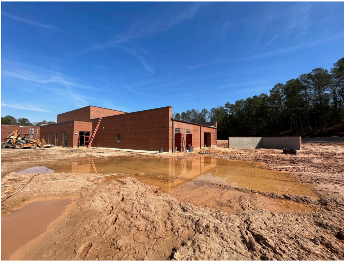
PHASE 2 EXTERIOR CONSTRUCTION PROGRESS