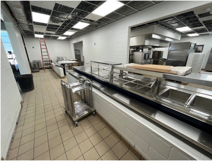
KITCHEN EQUIPMENT INSTALLATION NEARING COMPLETION.