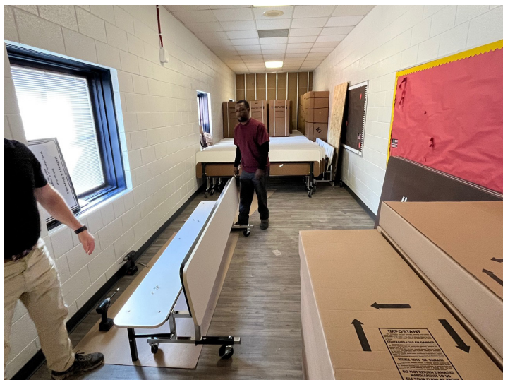
CAFETERIA TABLES BEING ASSEMBLED.