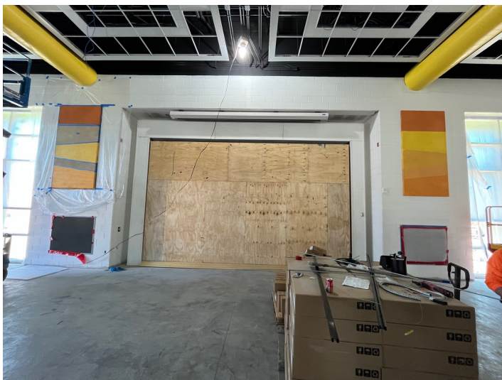
RETRACTABLE STAGE & PROJECTION SCREEN INSTALLATION COMPLETE