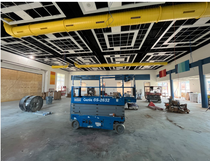
PHASE 2 INTERIOR CONSTRUCTION PROGRESS