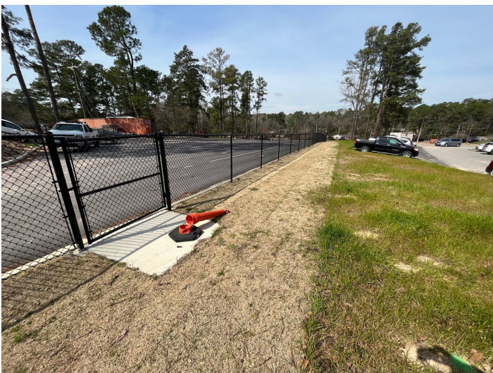
NEW FENCING BETWEEN SCHOOL & VEHICULAR QUEUING LANES.