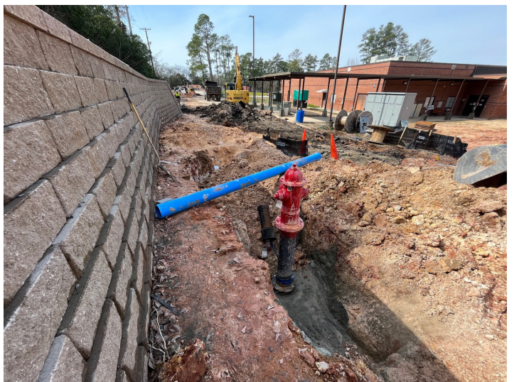
NEW FIRE WATER LINE & FIRE HYDRANT.