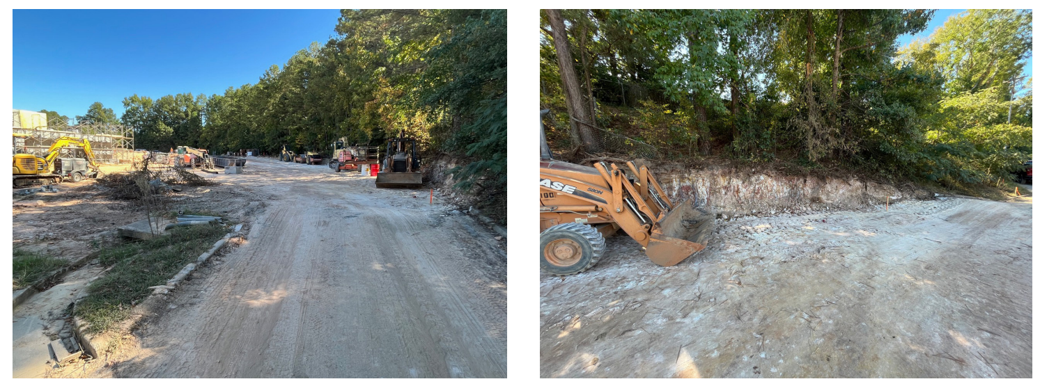
GRADING AND LOWERING OF HILLSIDE IS IN PROGRESS