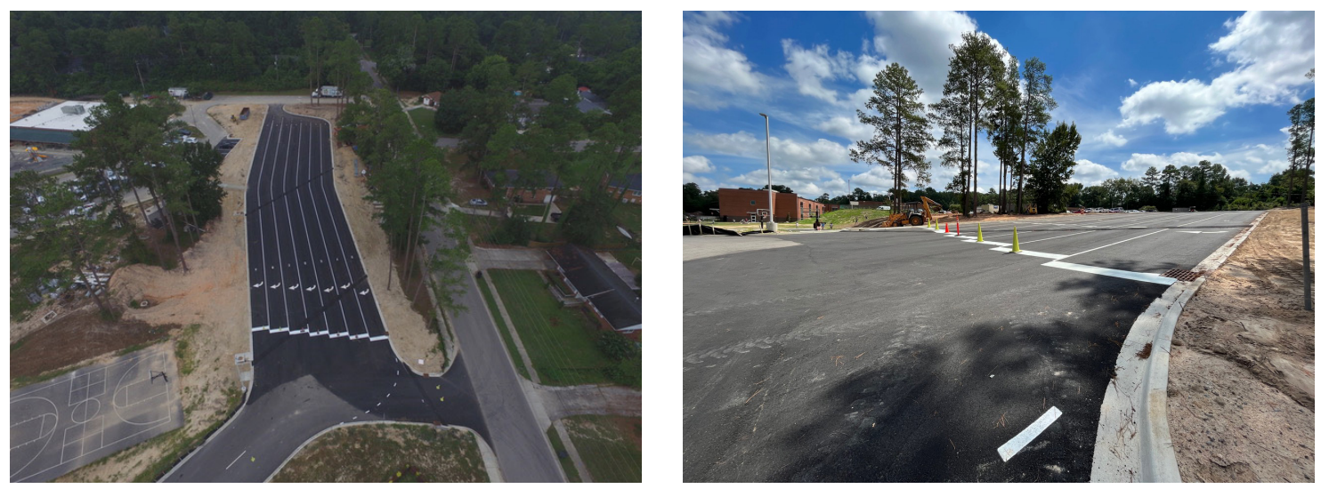
STRIPING FOR NEW VEHICULAR QUEING LANES AND PARKING SPACES COMPLETED