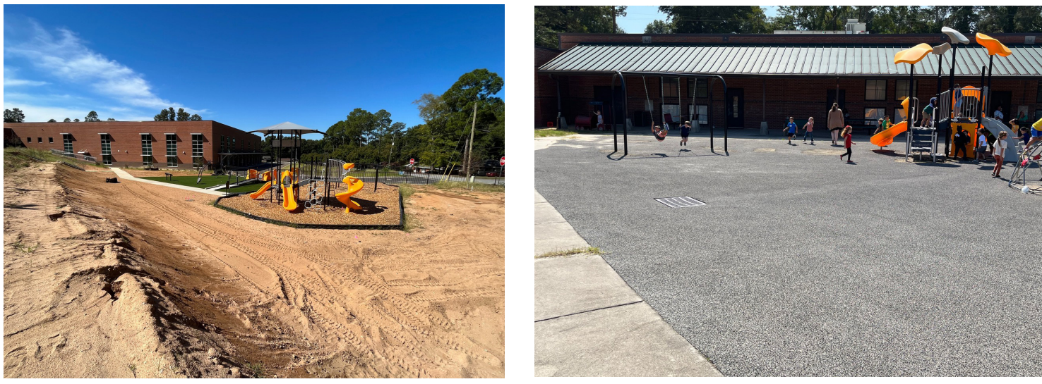
INSTALLATION OF NEW PLAYGROUND EQUIPMENT COMPLETED