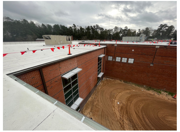
REROOFING OF EXISTING KINDERGARTEN & ADMINISTRATION WING