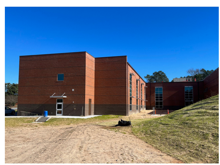
NEW 2-STORY CLASSROOM ADDITION EXTERIOR