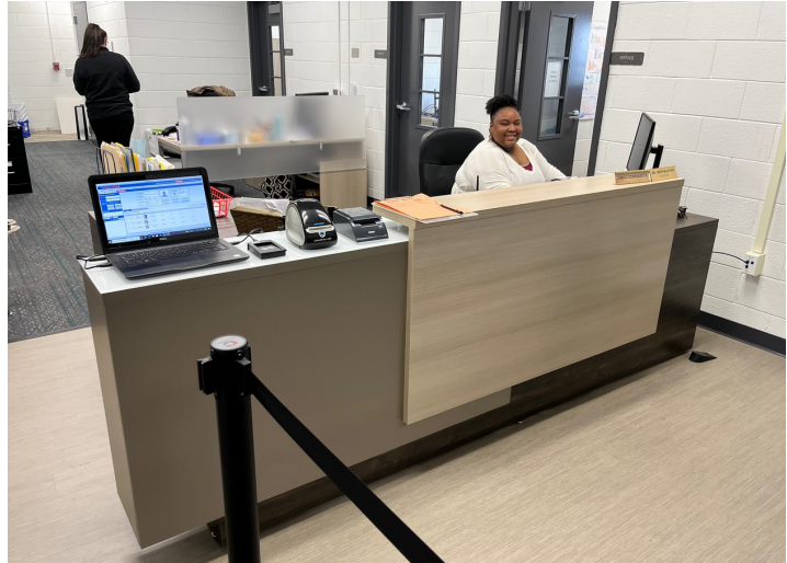
INTERIOR NEW 2-STORY CLASSROOM ADDITION & EXISTING ADMINISTRATION OFFICE