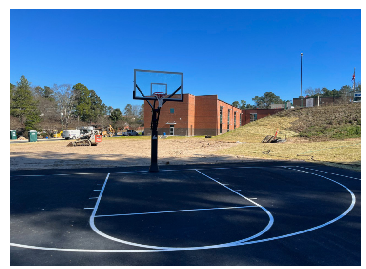
NEW PLAYGROUND AREAS