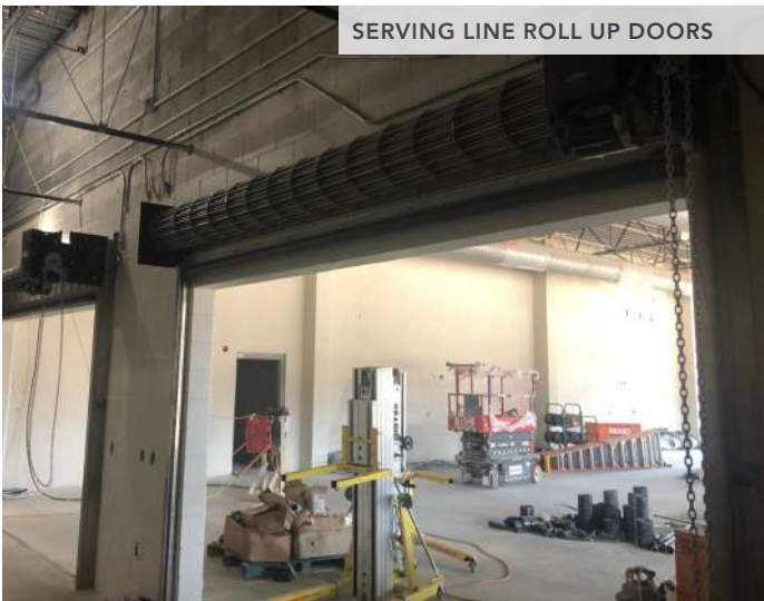
SERVING LINE ROLL UP DOORS