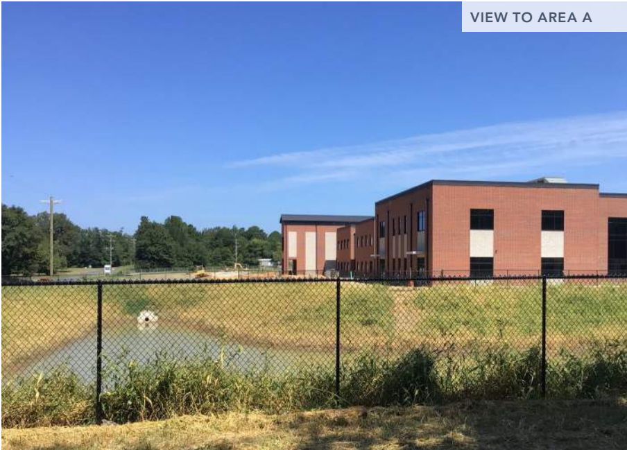
VIEW TO AREA A