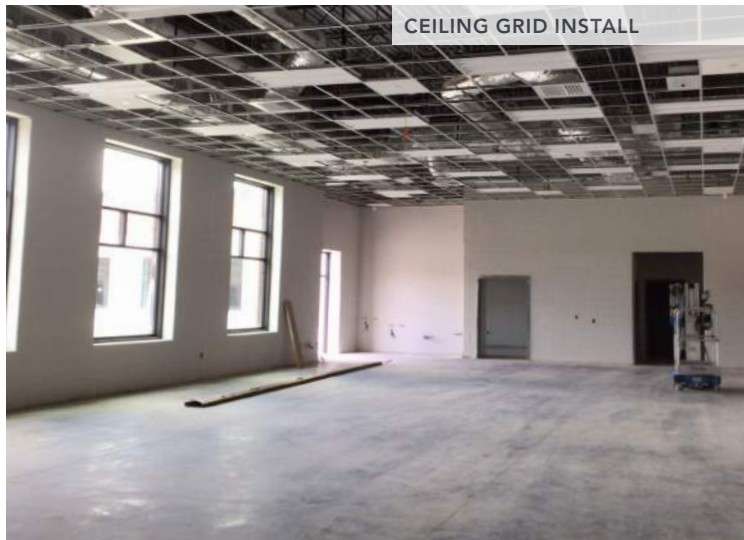
CEILING GRID INSTALL