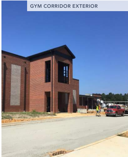
GYM CORRIDOR EXTERIOR