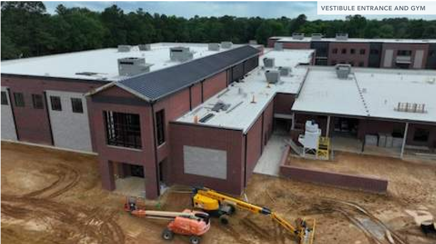
VESTIBULE ENTRANCE AND GYM