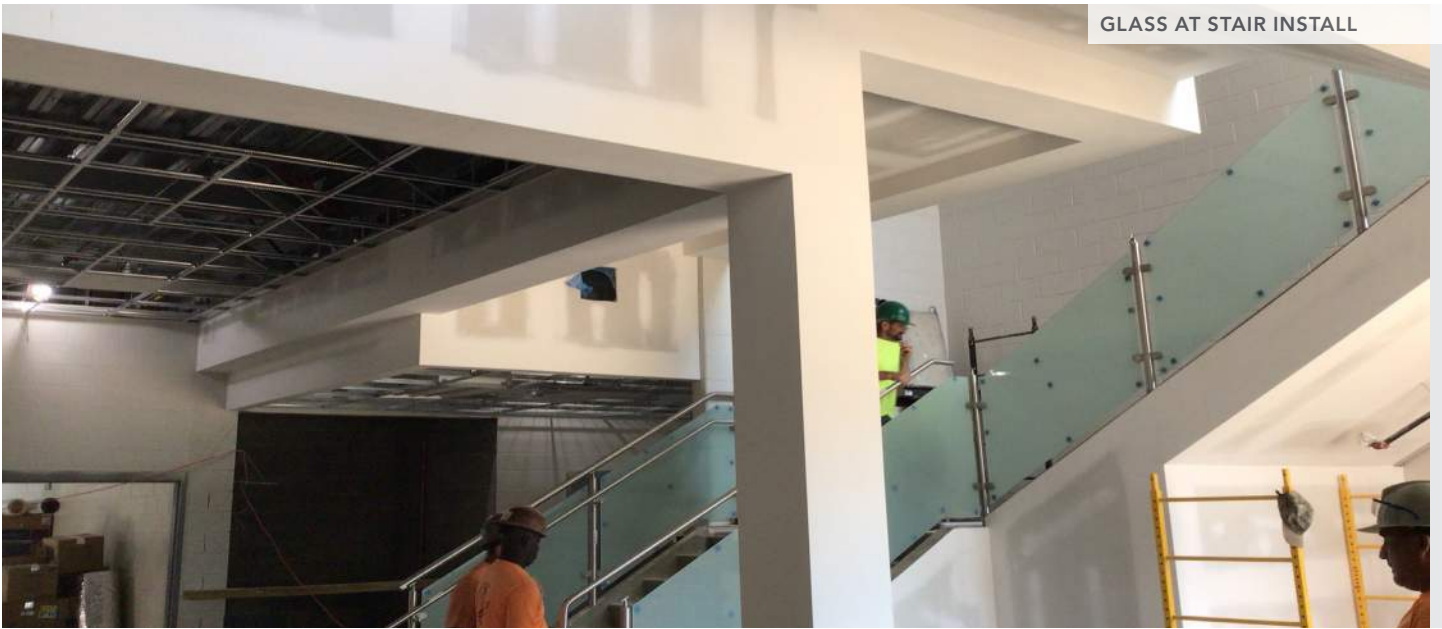
GLASS AT STAIR INSTALL