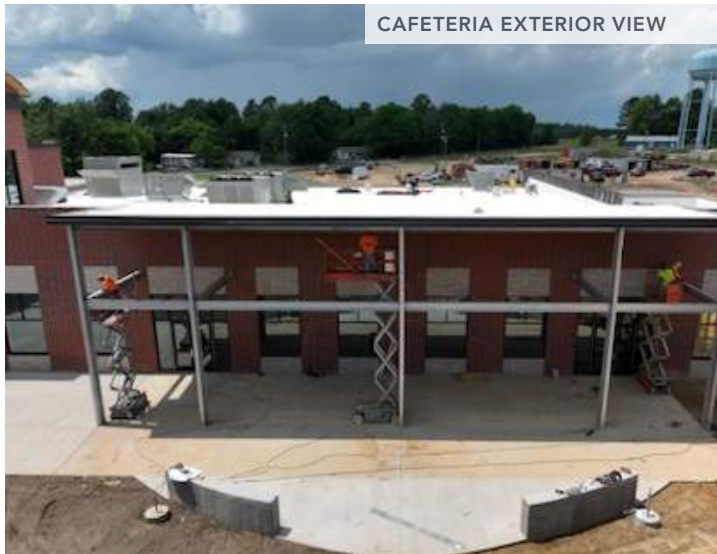
CAFETERIA EXTERIOR VIEW