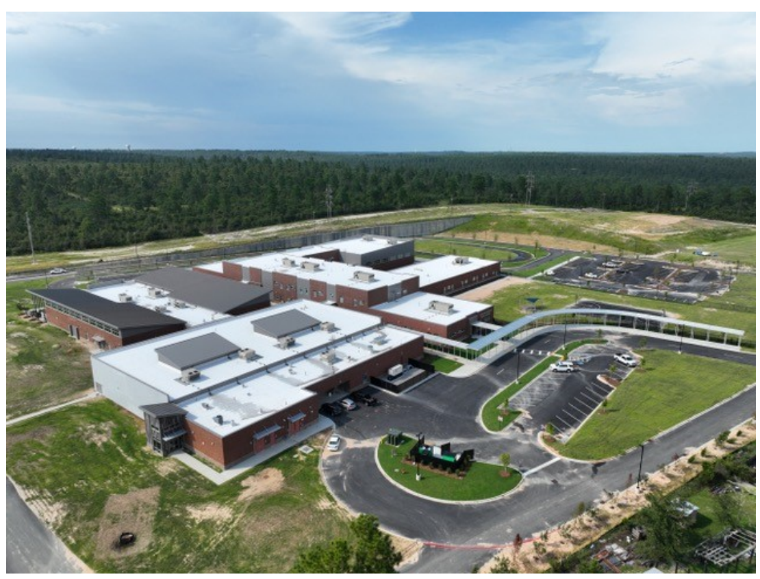
Aerial view Northeast