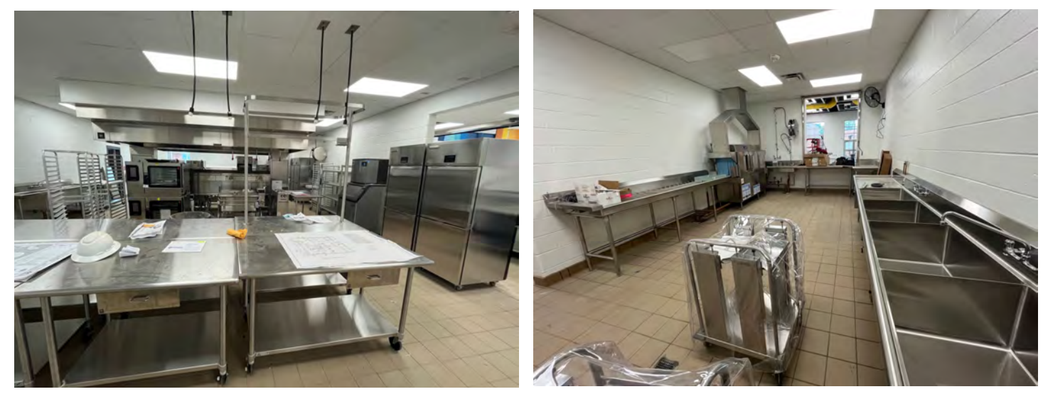
KITCHEN EQUIPMENT UTILITY CONNECTIONS COMPLETED.