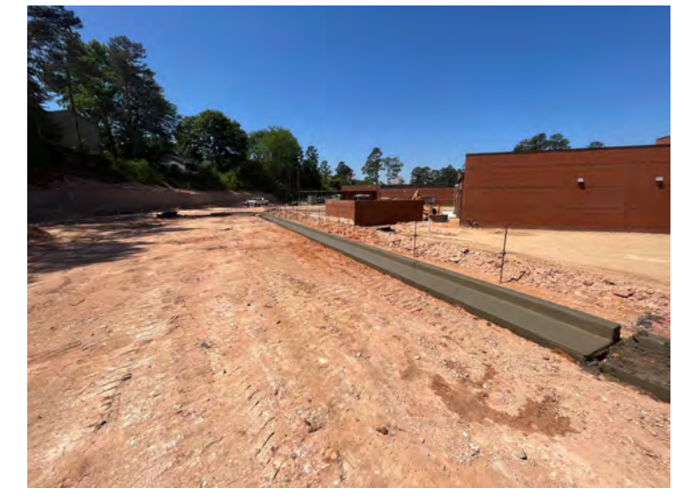
PHASE 2 SITE WORK PROGRESS