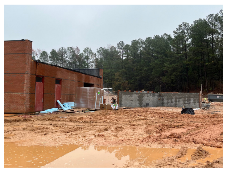
NEW DUMPSTER SCREEN WALL