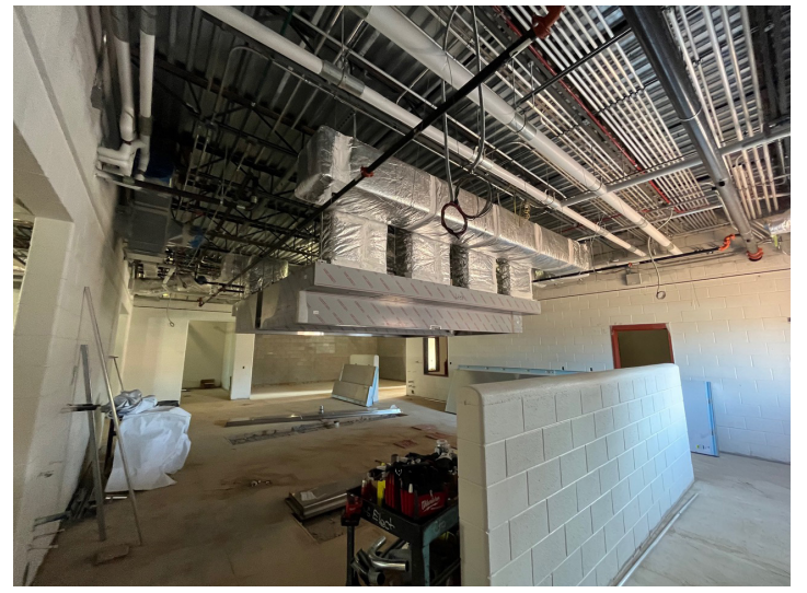
KITCHEN EXHAUST HOOD DUCTWORK