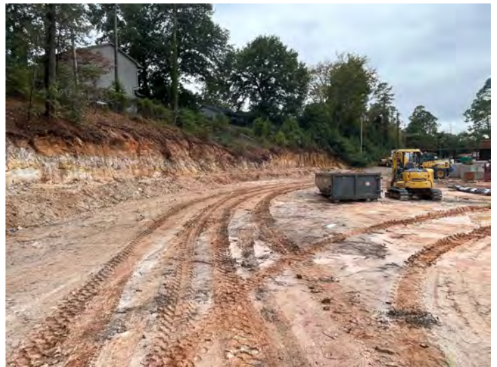
LOWERING OF ROADWAY & EXCAVATION OF HILLSIDE IS STILL IN PROGRESS