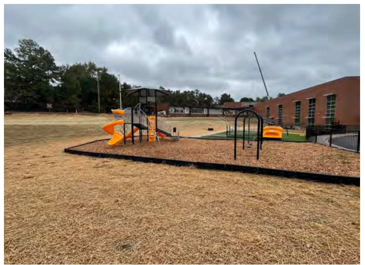
GRADING & GRASSING AROUND NEW PLAYGROUND COMPLETED