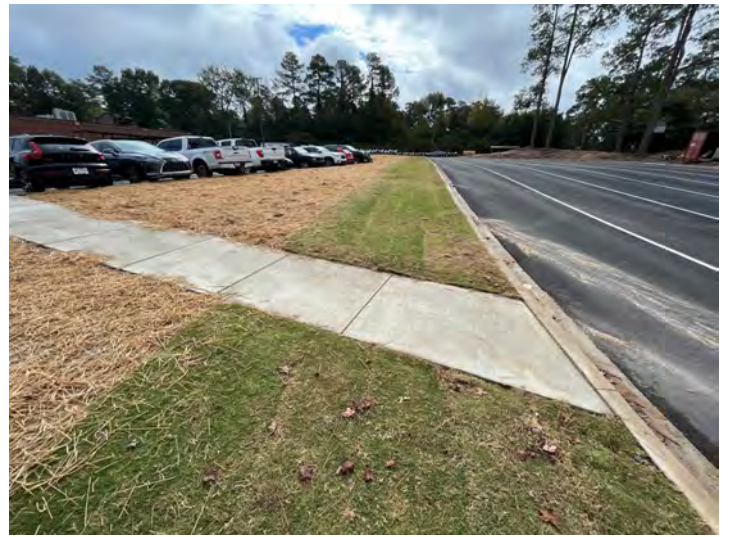
SODDING, GRASSING & IRRIGATION ON EACH SIDE OF VEHICULAR QUEING LANES COMPLETED.