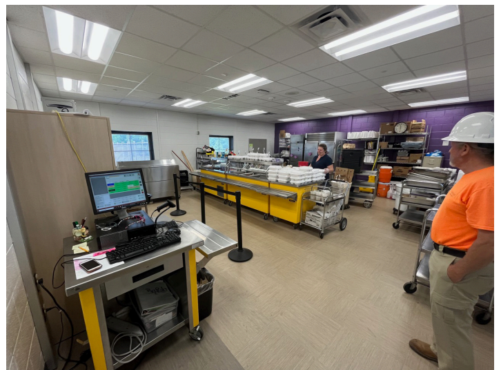
TEMPORARY KITCHEN SERVING LINE