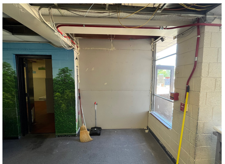
TEMPORARY PARTITION BETWEEN EXISTING BUILDING & NEW CONSTRUCTION