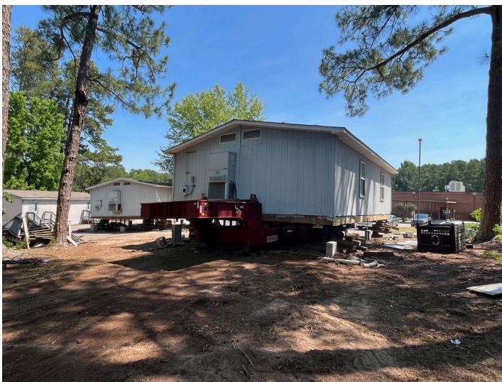
PORTABLE CLASSROOM BEING PREPARED FOR REMOVAL