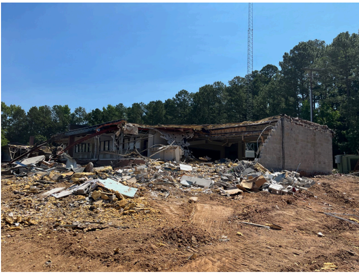
DEMOLITION OF EXISTING 7-CLASSROOM WING