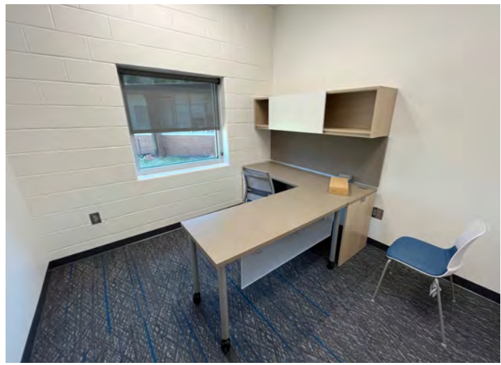
INTERIOR NEW 2-STORY CLASSROOM ADDITION