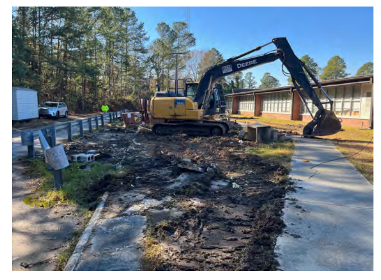
DEMOLITION OF EXISTING MOBILE UNITS