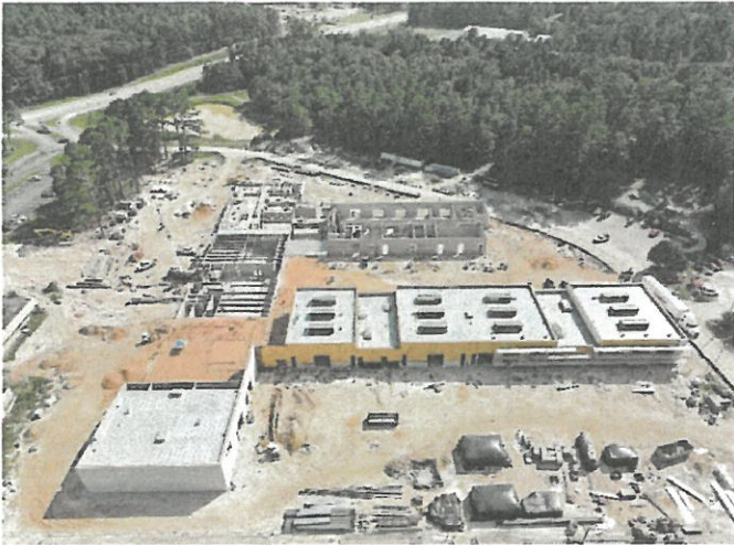
NORTH SIDE AERIAL