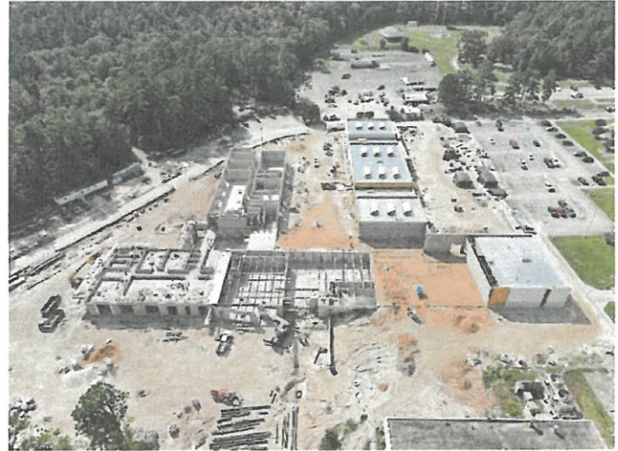
EAST SIDE AERIAL