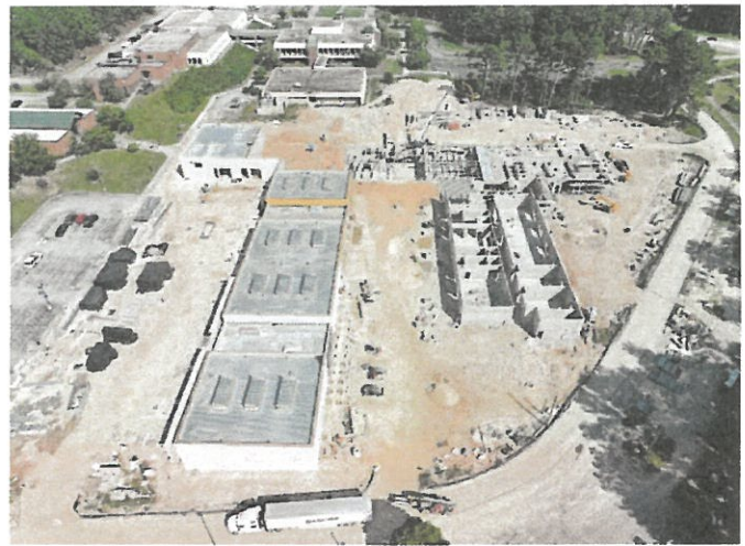
WEST SIDE AERIAL