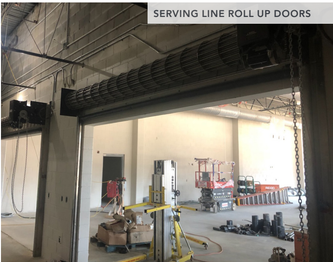
SERVING LINE ROLL UP DOORS