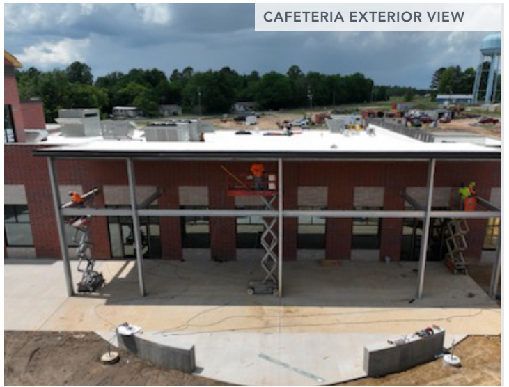
CAFETERIA EXTERIOR VIEW