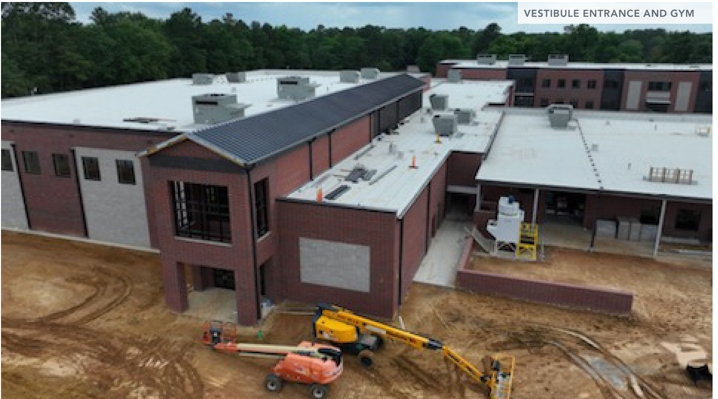
VESTIBULE ENTRANCE AND GYM