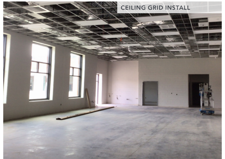
CEILING GRID INSTALL