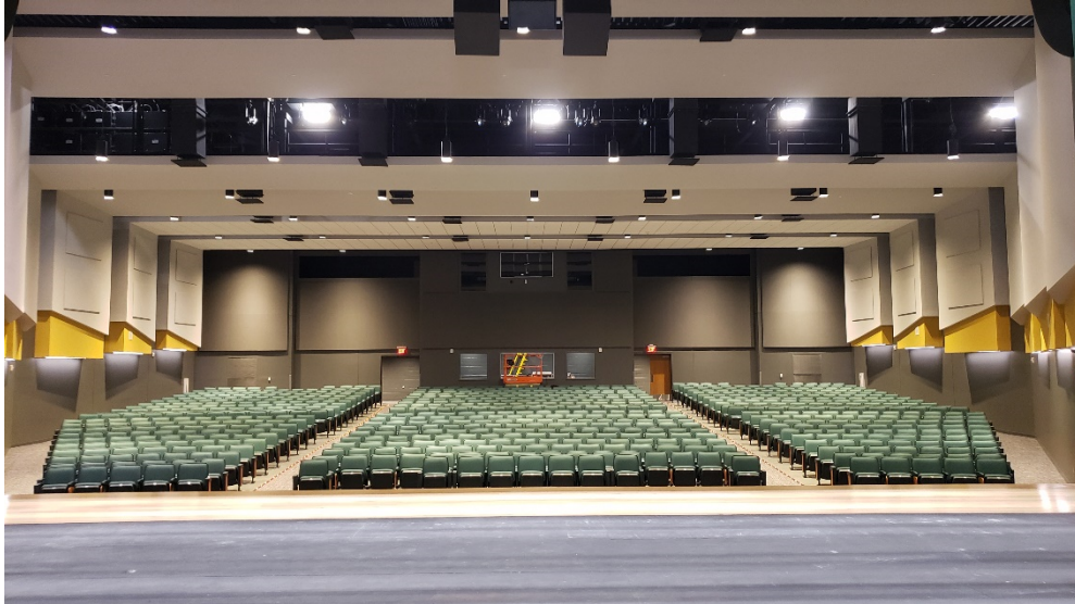
Auditorium 108 [10.17.2023]