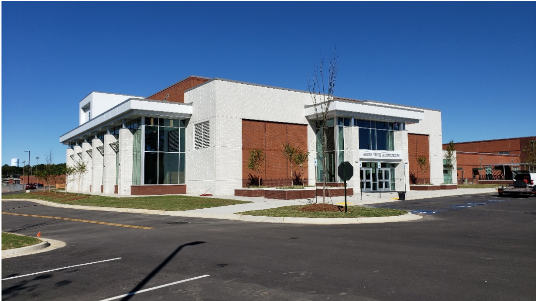
East Elevation [10.17.2023]