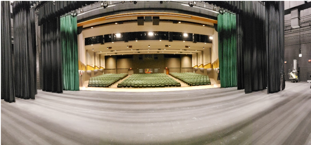
Stage 109 [10.17.2023]