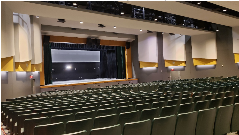
Auditorium 108 [10.17.2023]