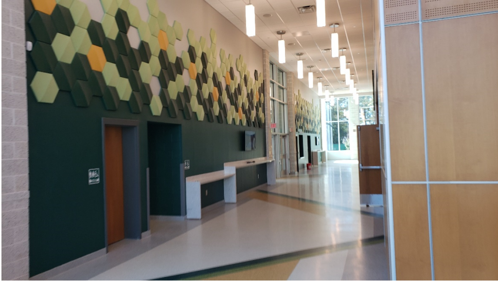
Corridor 101 [10.17.2023]