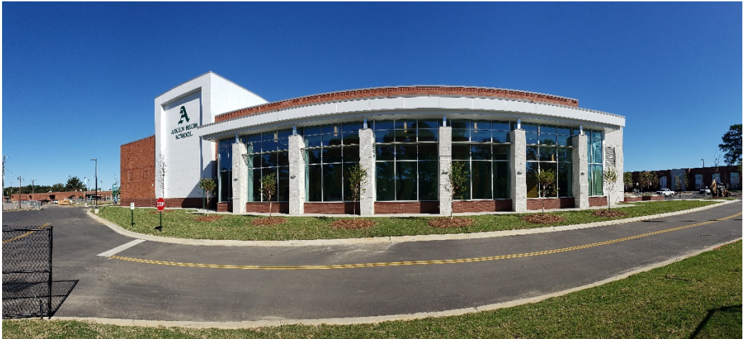
South Elevation [10.17.2023]