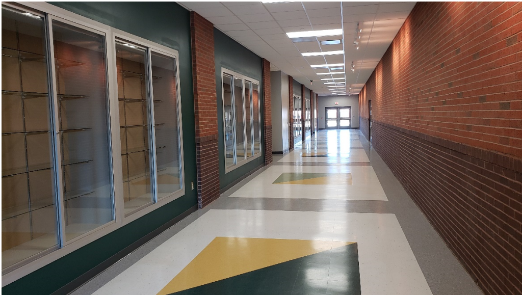
Corridor 101D [10.17.2023]