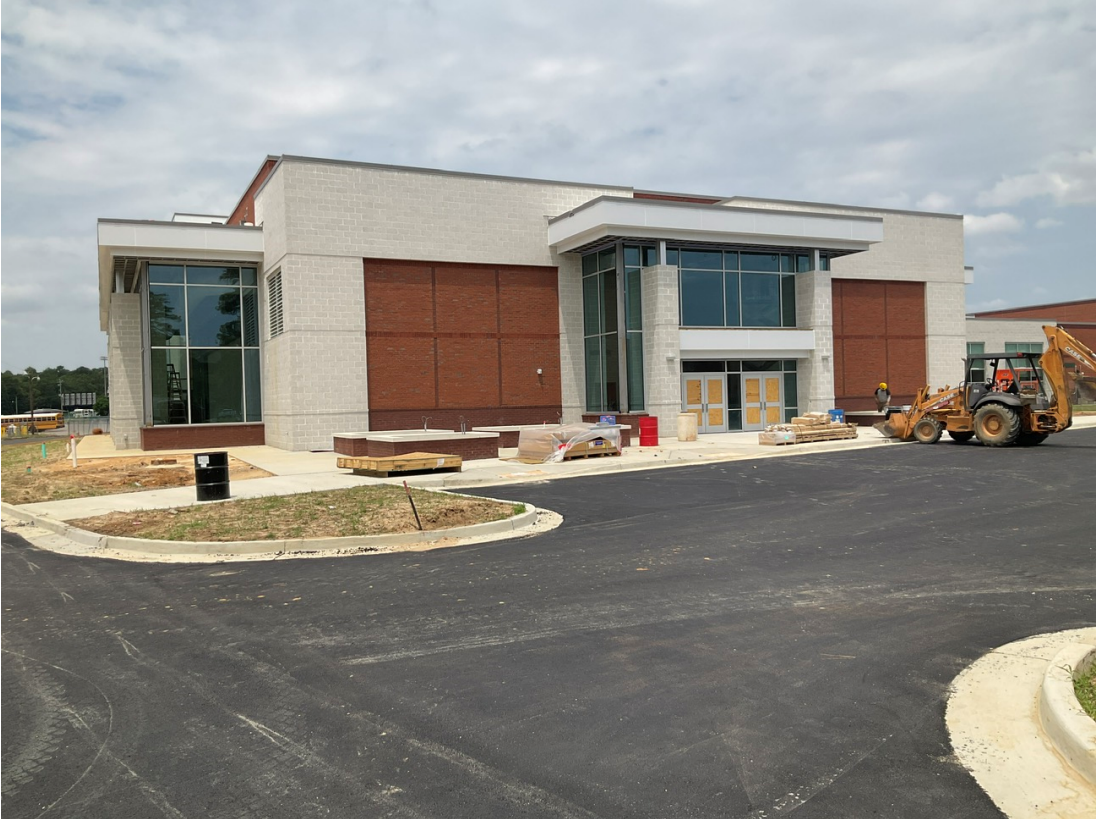
East Elevation [05.24.2023]