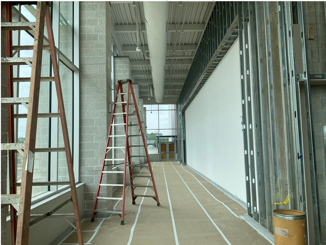
Corridor 101C [05.24.2023]