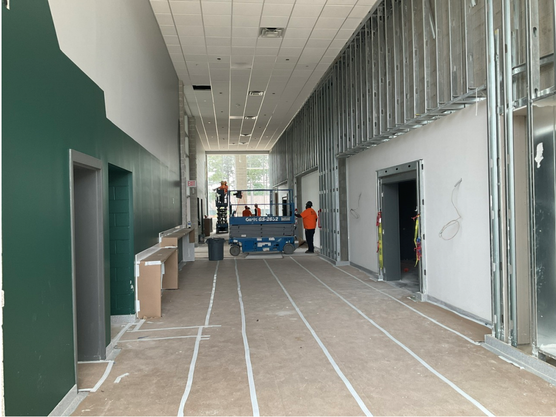
Corridor 101 [05.24.2023]