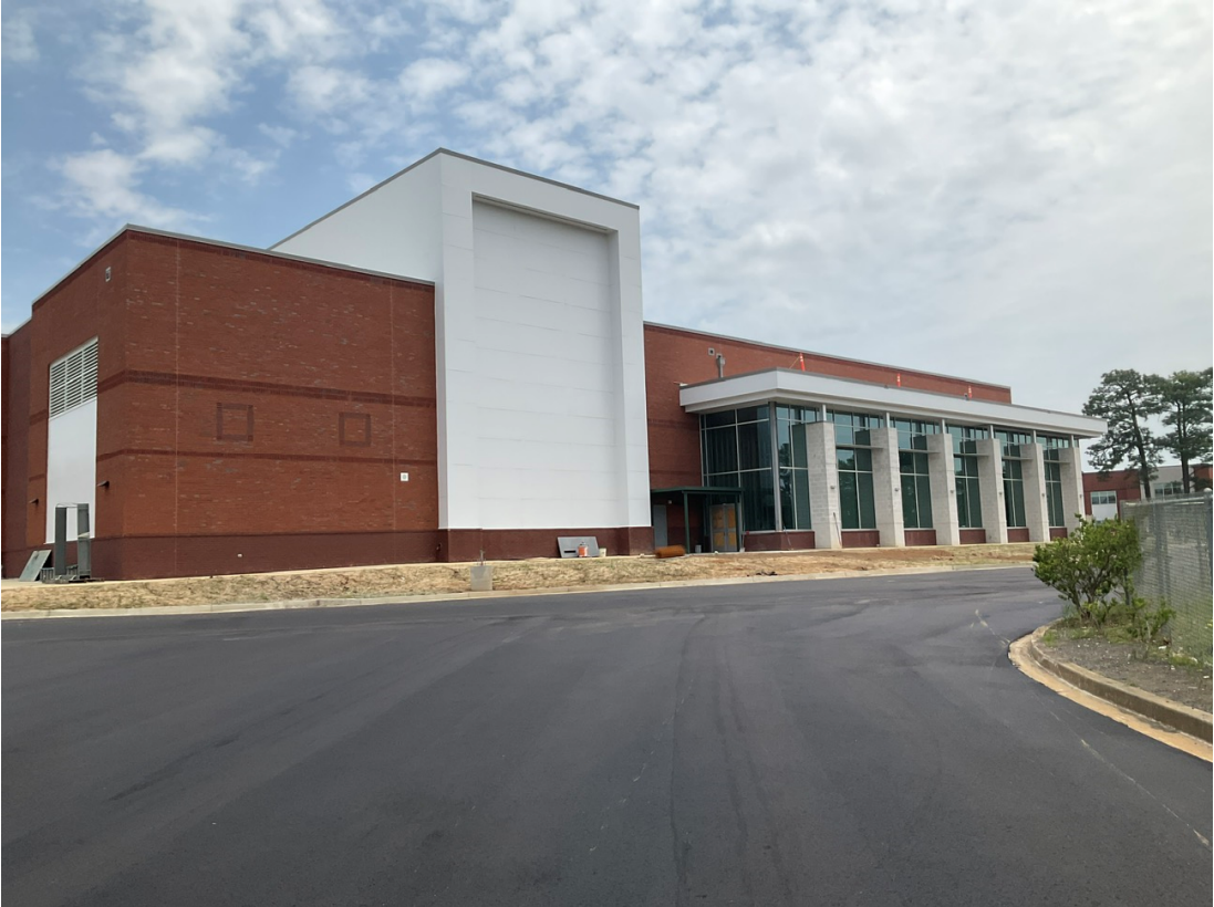
South Elevation [05.24.2023]