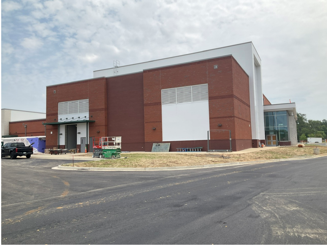
West Elevation [05.24.2023]