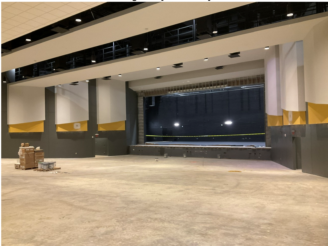
Auditorium 108 [05.24.2023]