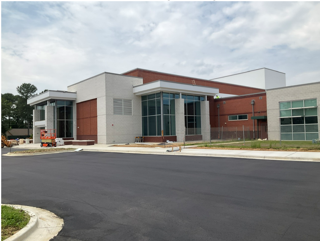
North Elevation [05.24.2023]