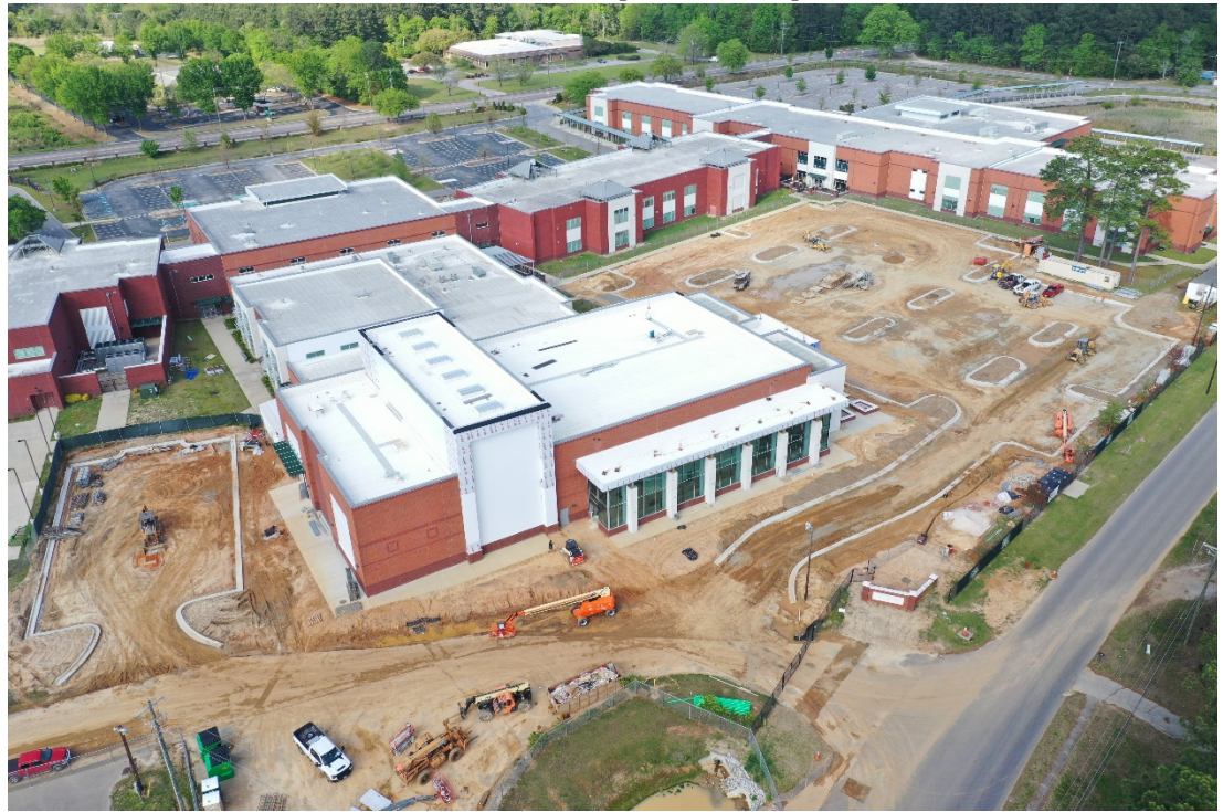
Campus view looking north