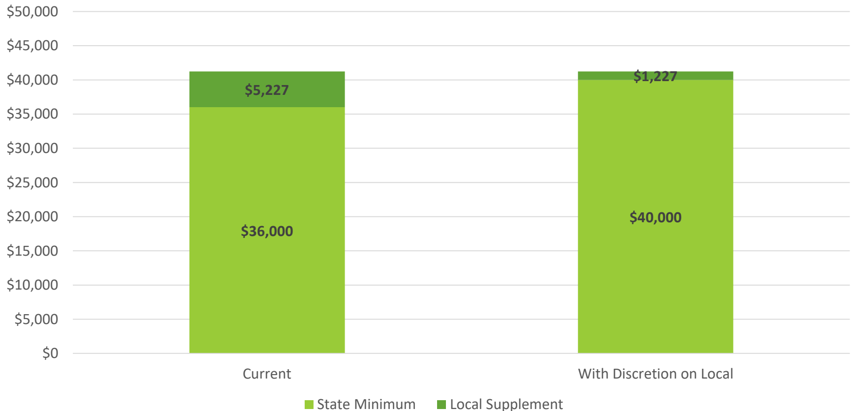
EXAMPLE – BACHELORS/STEP 0