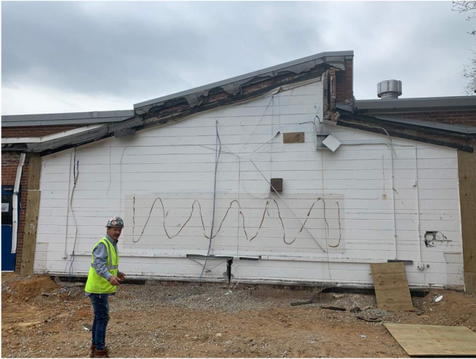
Demolition of the existing classroom wing is complete.