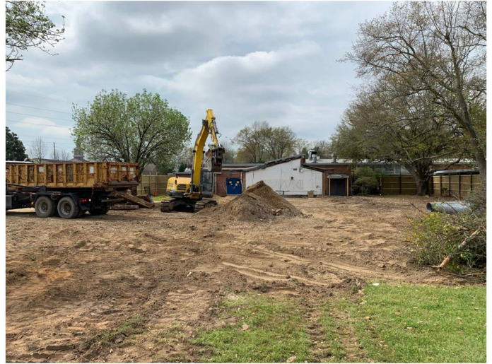
Demolition of the existing classroom wing is complete.