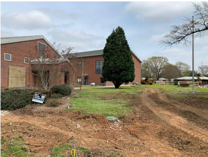
Site demolition is in progress.