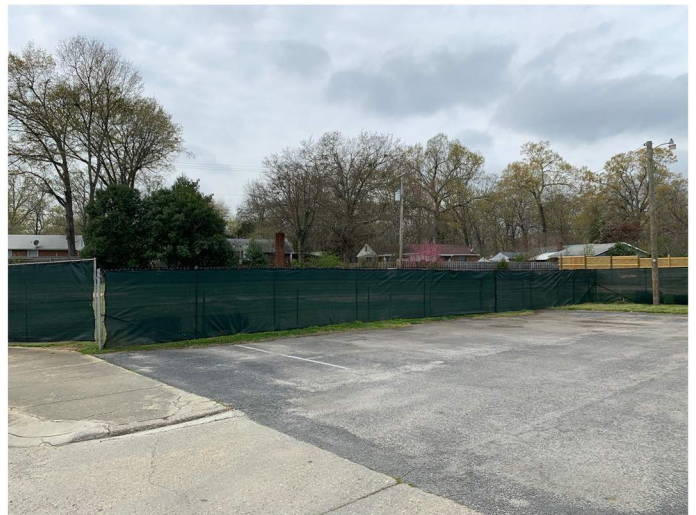
Site fencing has been installed to secure the lay-down area.