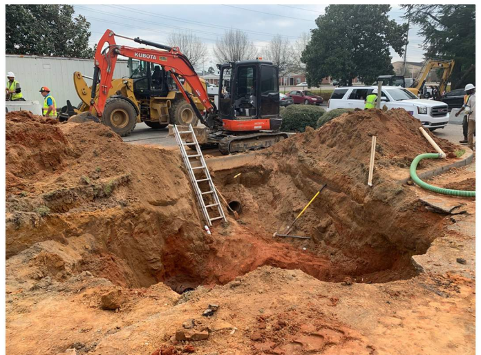
Site utility work is in progress to clear area for new building pad.