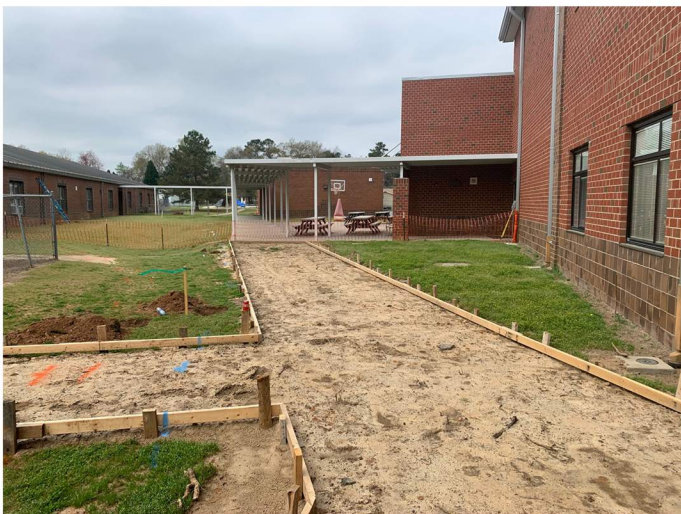
Sitework is underway to support the Phase 1 site conditions.