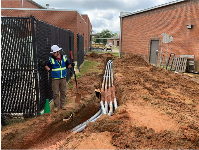
New electrical conduit being installed.