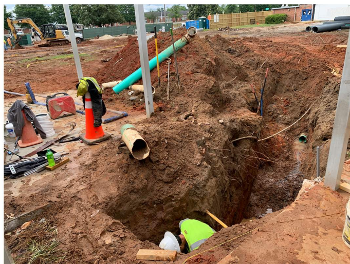
Utility work in progress.