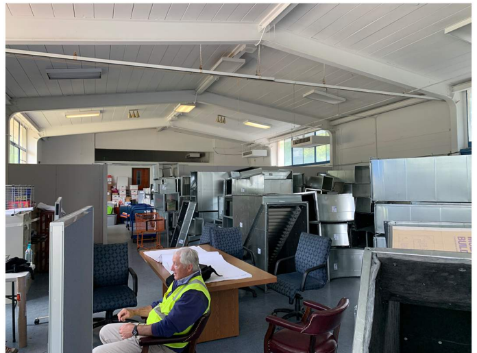
Mechanical material stored on site.