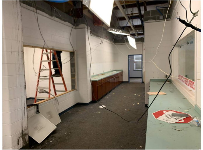
Demolition has begun inside of Area 1.