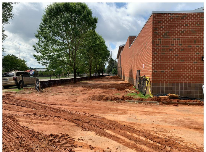
Utility work completed along Waites Street.