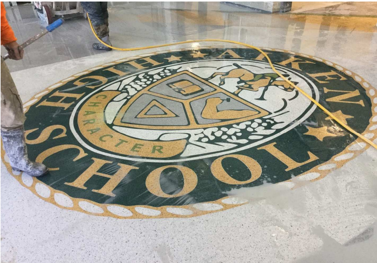
Terrazzo with graphic design at entrance lobby