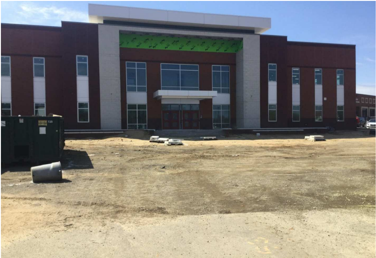
Majority of admin building envelope complete