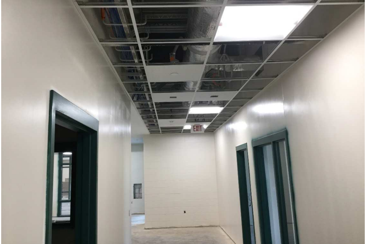
Ceiling grid, paint and fixtures at admin building corridor