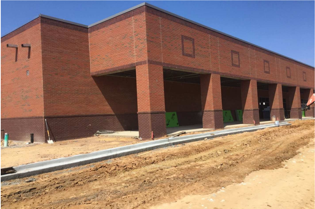
Curb and gutter along bus drop off canopy