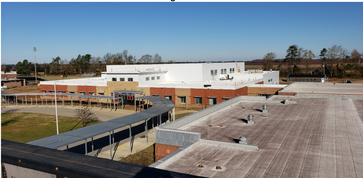
Gymnasium Building – Front Elevations