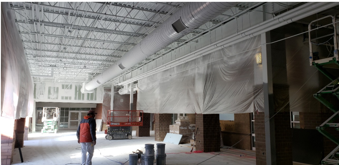
Area "C" – Cafeteria Expansion