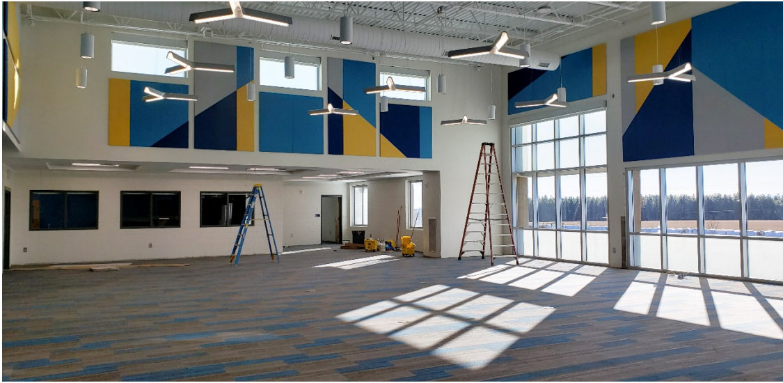
Area "A" – 2 nd Floor – Reading Room