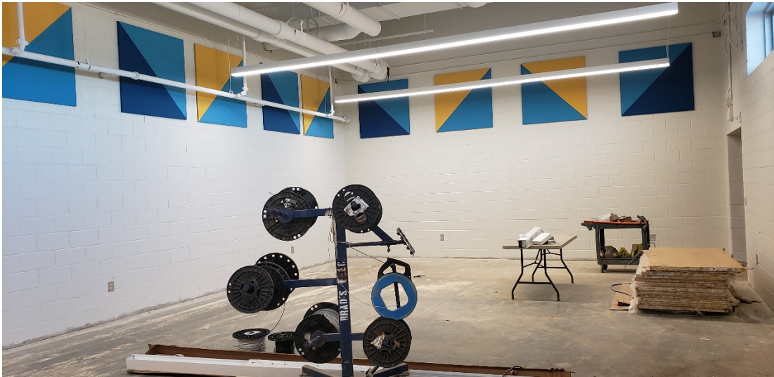
Area "D" – Weight Room