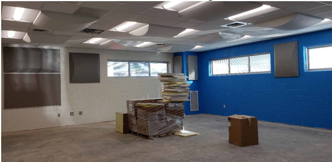
Area "B" – Chorus Room