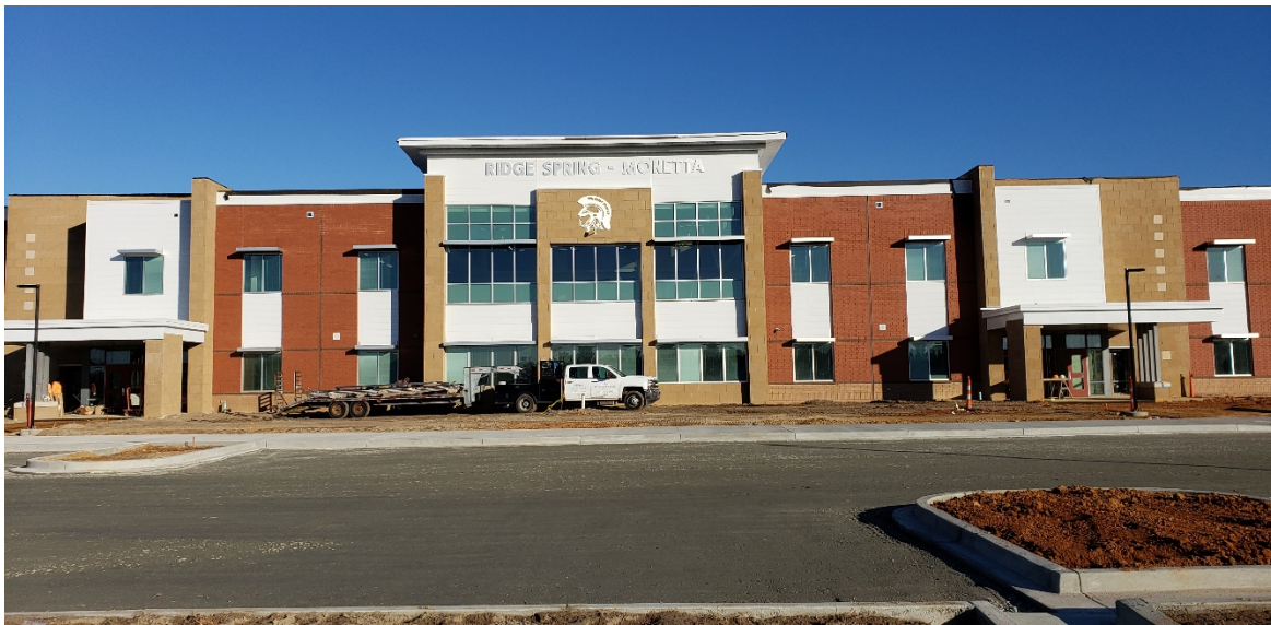
Main Building – Front Elevation