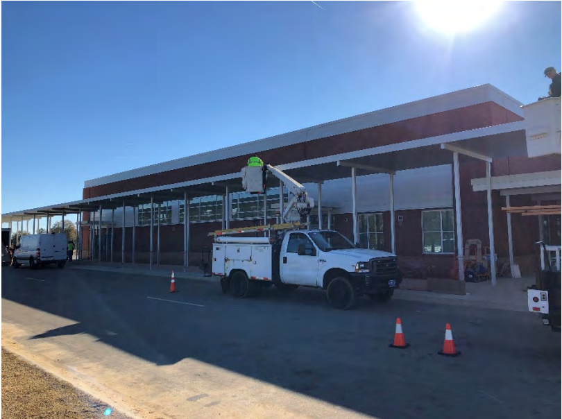
Area "C": Physical Education