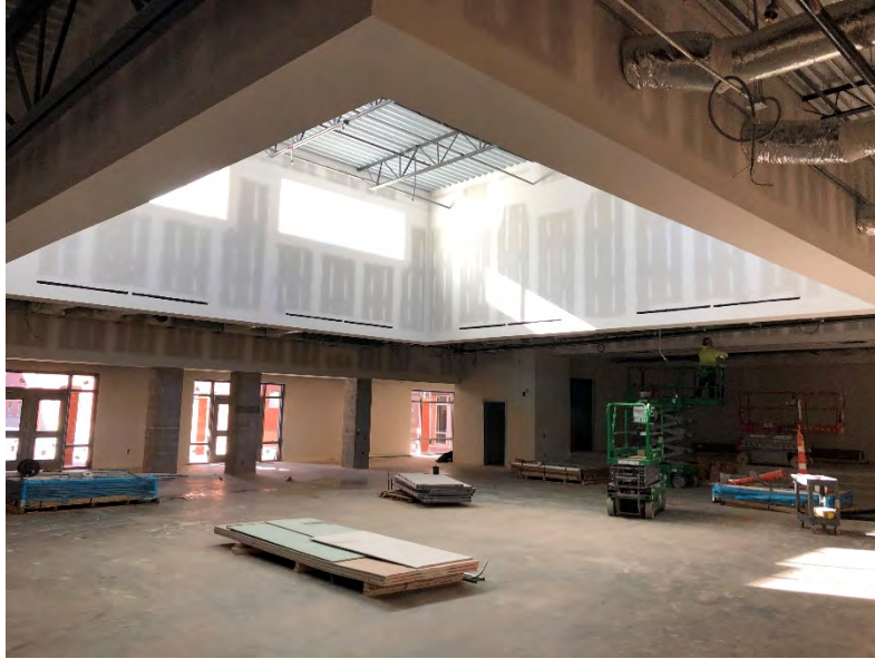
Area "C": Dining Area