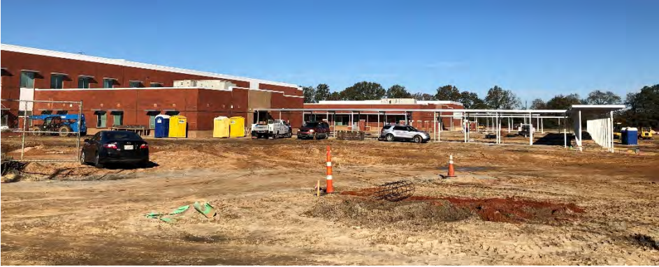
Area "A": Classroom Addition