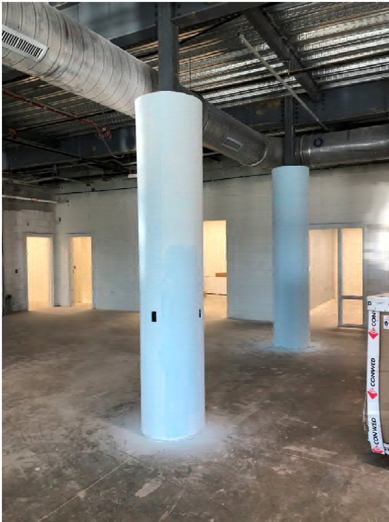
Area "A": Media Center