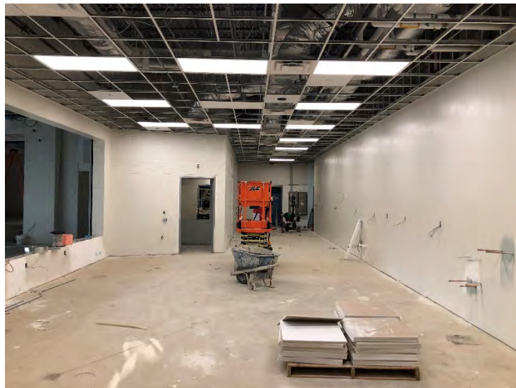
Area "C" – Kitchen and Serving Line