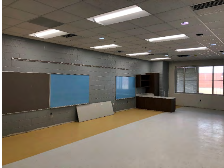
Area "B" – 1 st Floor Classroom