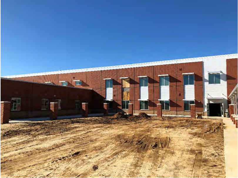
Area "B": Classroom Addition and Kindergarten Wing