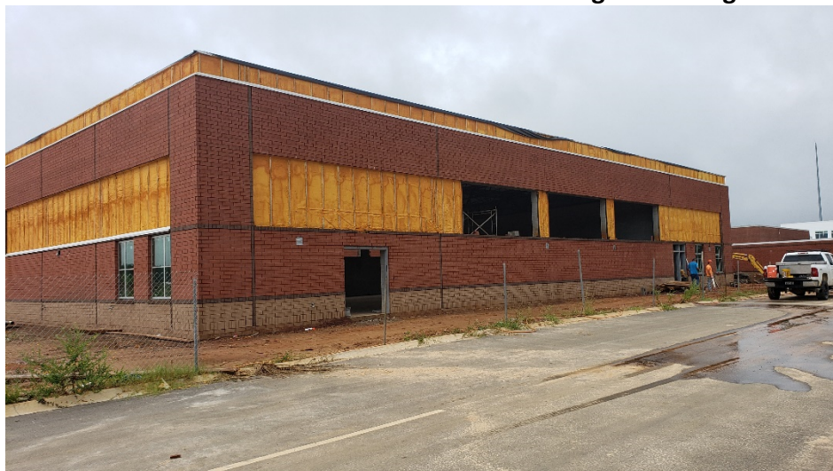
Area "C": Physical Education