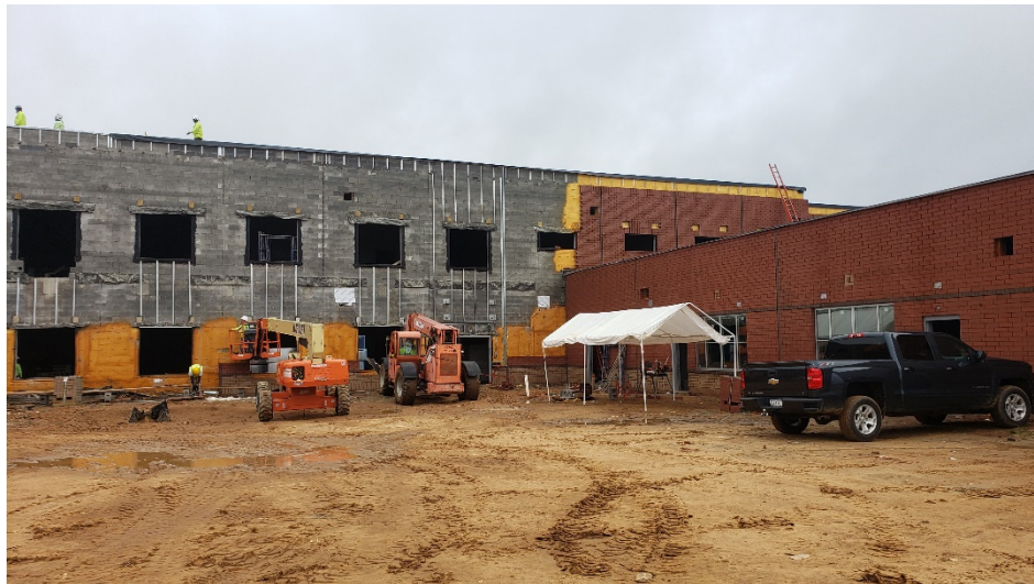
Area "B": Classroom Addition and Kindergarten Wing