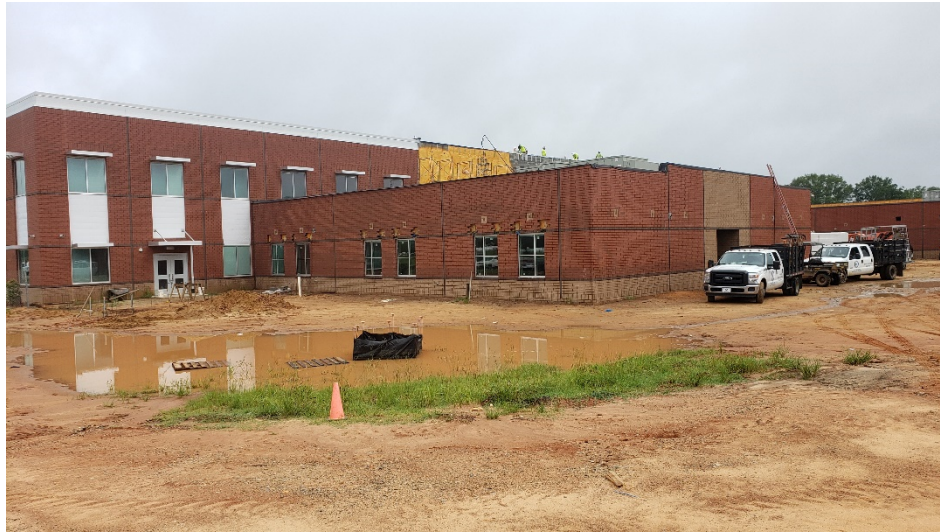
Area "A": Classroom Addition