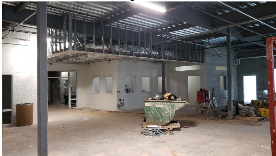
Area "A": Media Center