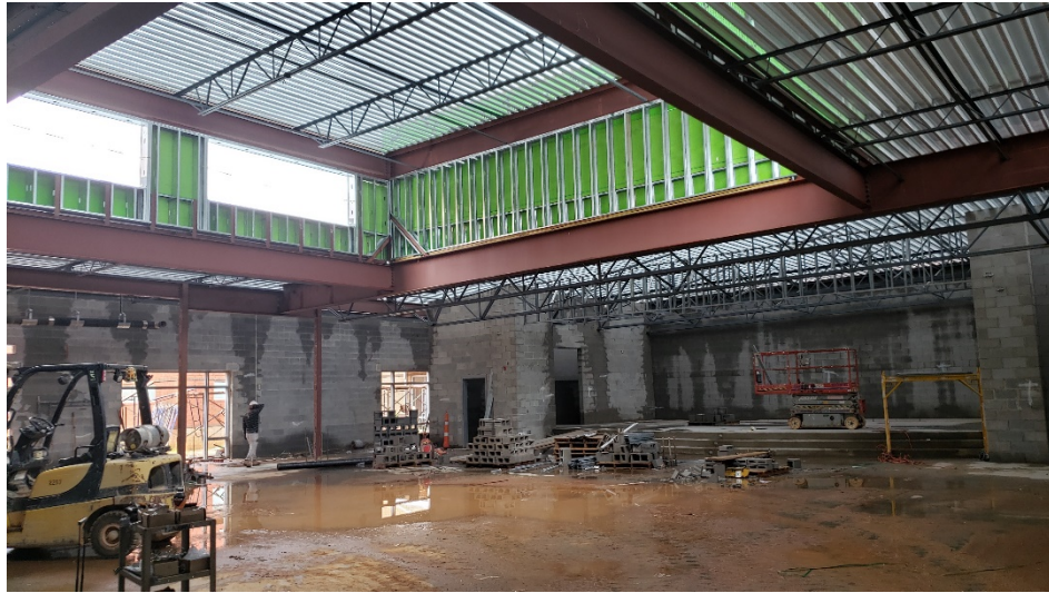
Area "C": Dining Area and Platform