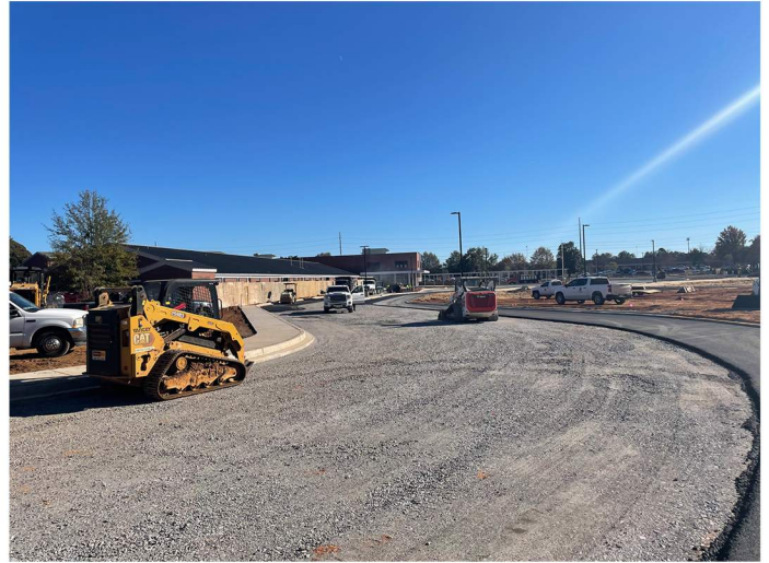
Exterior progress photo. Asphalt installation is in progress.