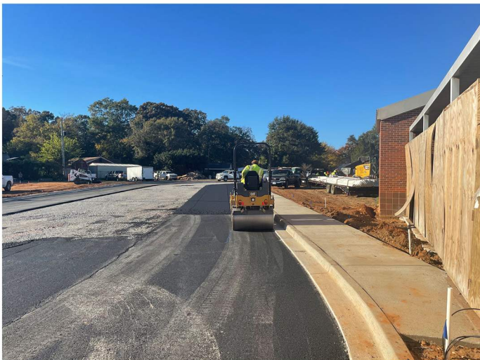
Exterior progress photo. Asphalt installation is in progress.