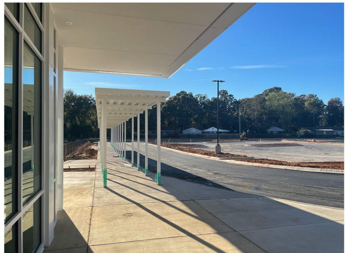
Exterior progress photo.