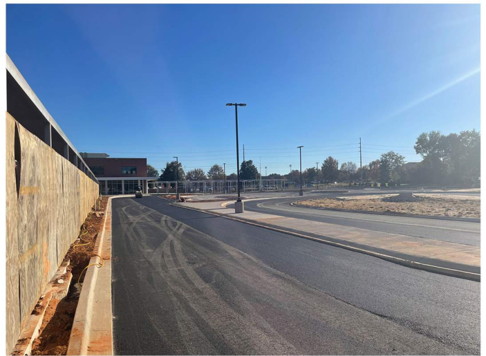
Exterior progress photo. Asphalt installation is in progress.