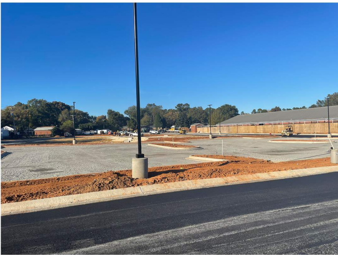
Exterior progress photo. Asphalt installation is in progress.