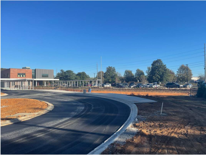
Exterior progress photo. Asphalt installation is in progress.