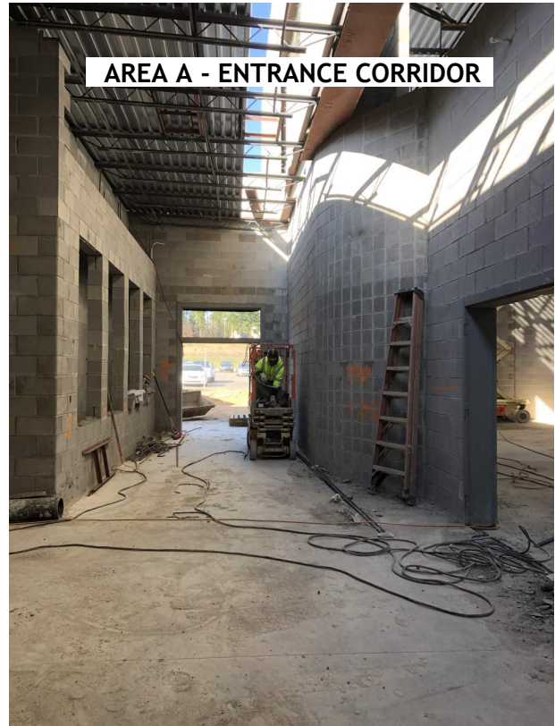
AREA A - ENTRANCE CORRIDOR