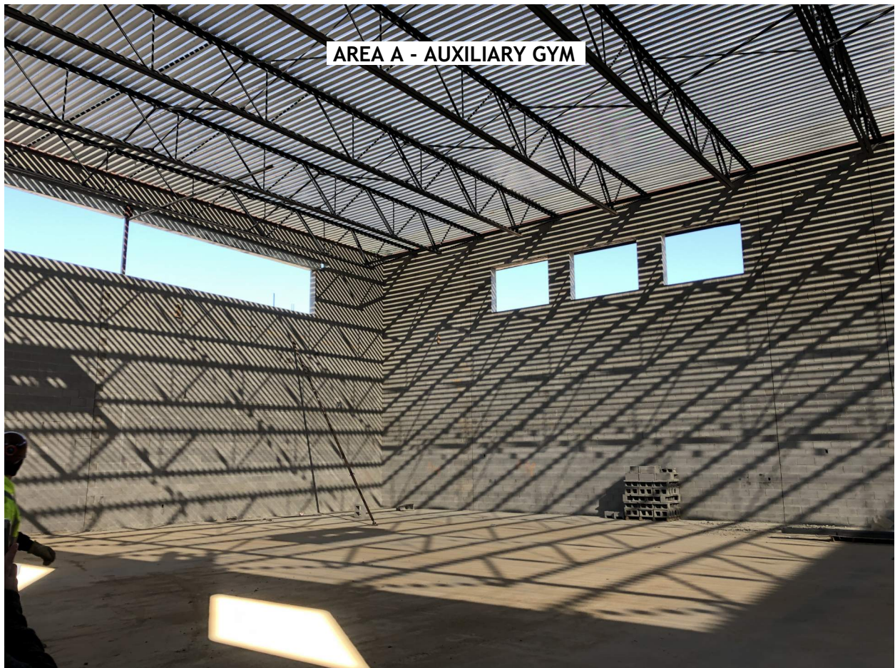
AREA A - AUXILIARY GYM