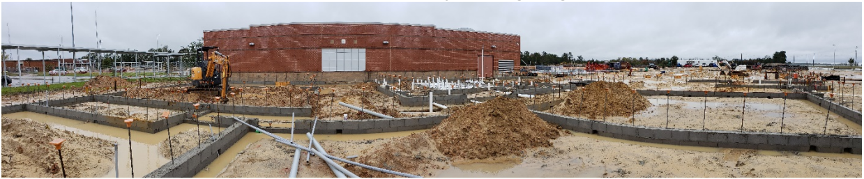
Area "A" foundations, below-grade CMU, rough-ins