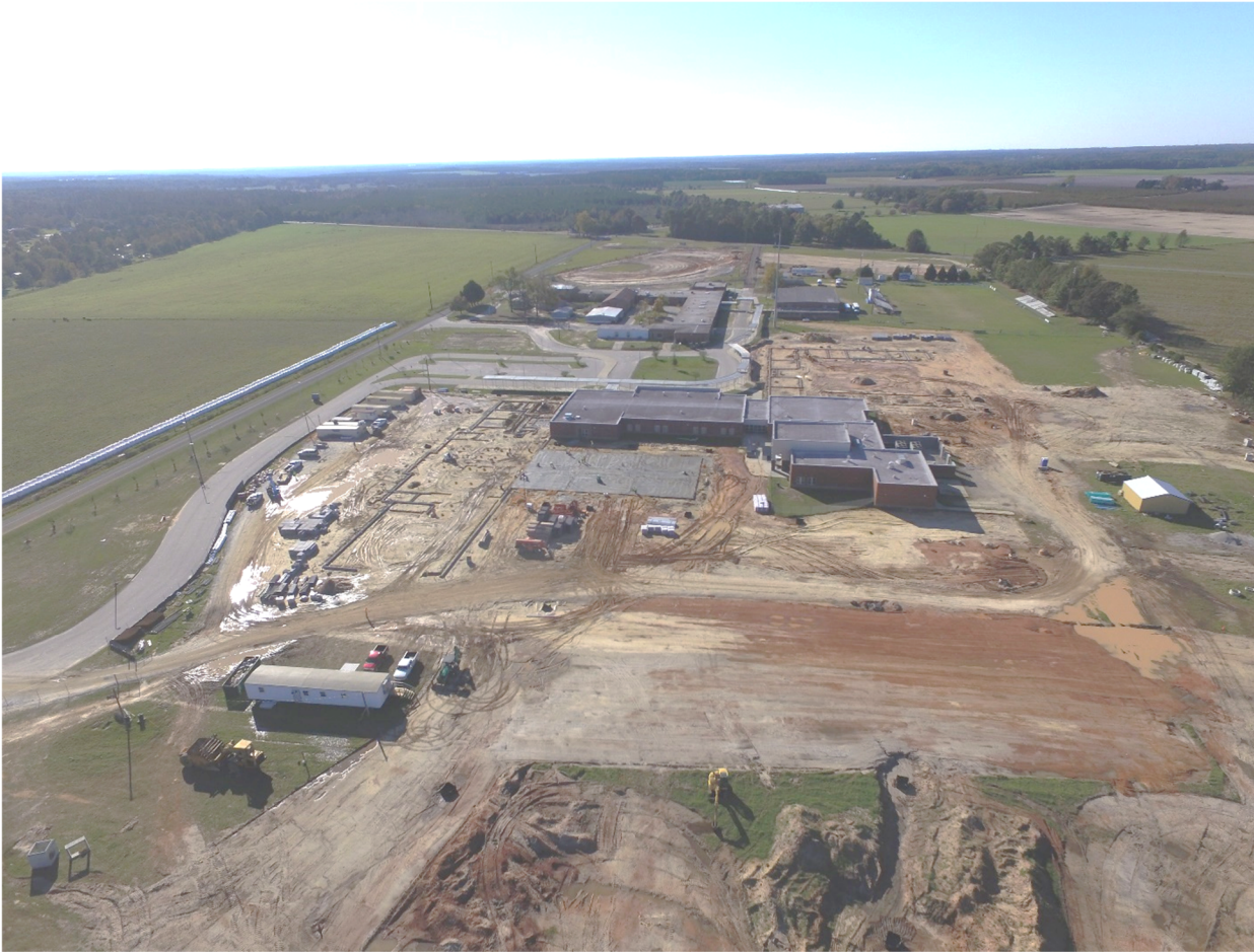
Aerial View looking West