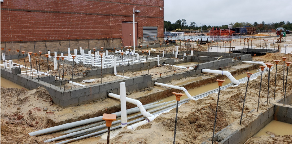
Area "A" foundations, plumbing rough-in