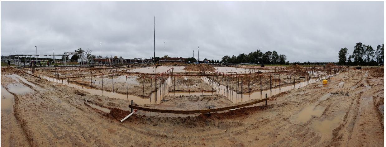
Area "D" foundations