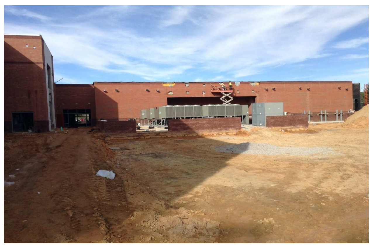
Cooling towers at loading dock equipment yard