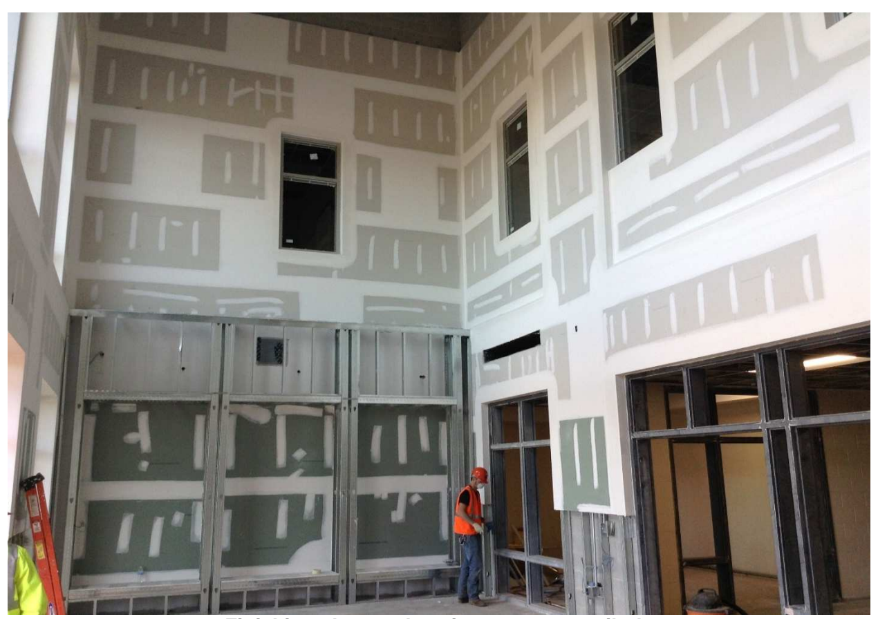
Finishing sheetrock main entrance vestibule