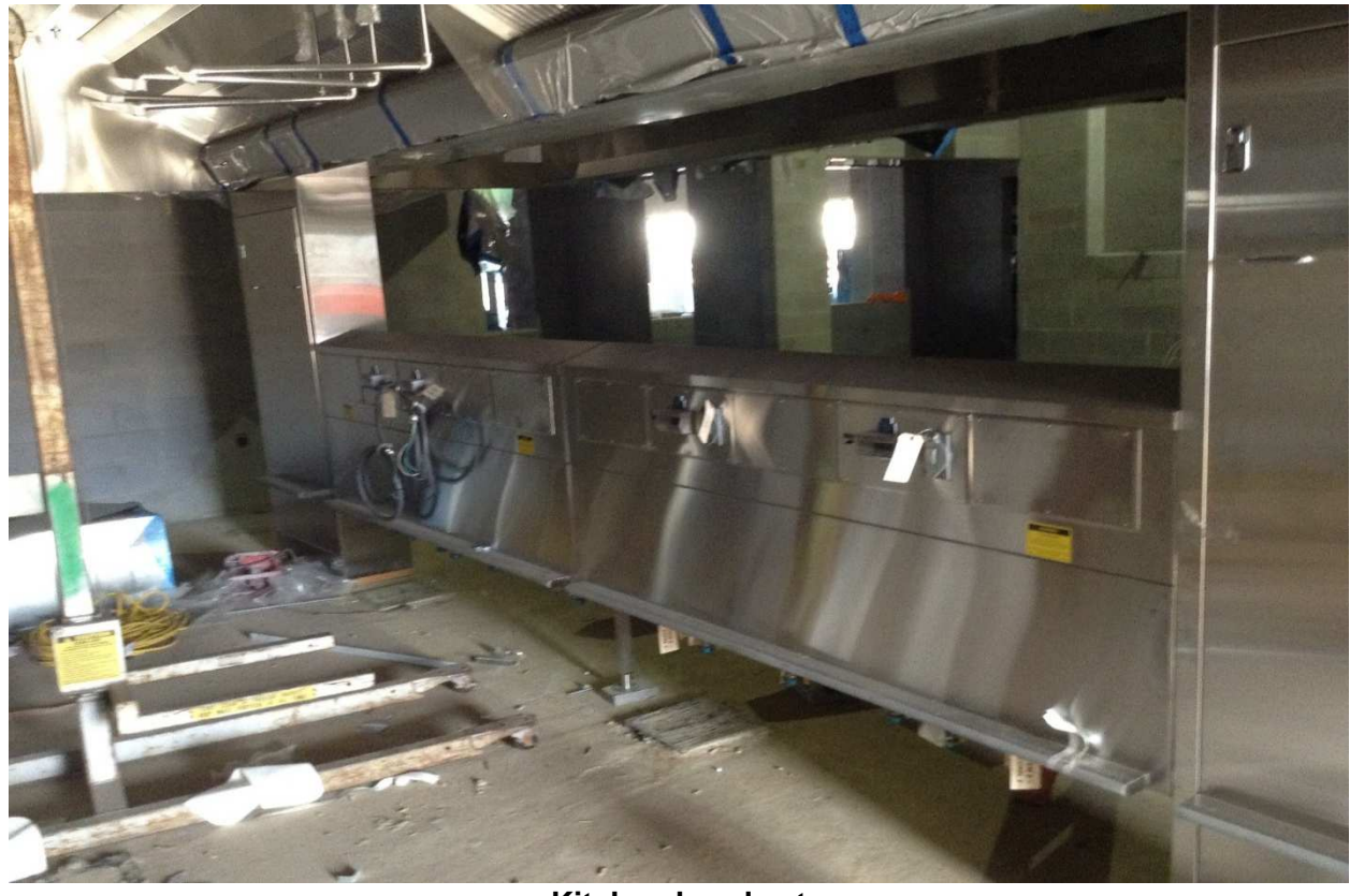
Kitchen hood set