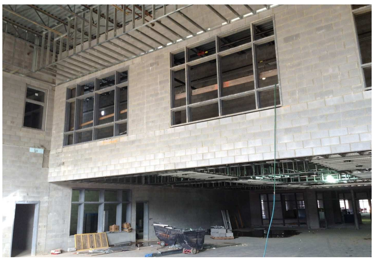
Stud framed ceilings in media center clear story entrance