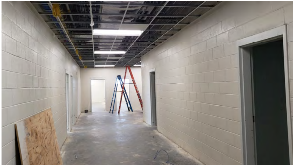
Area "B" – Second Floor Corridor