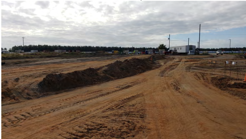
Site – Parking rough grading