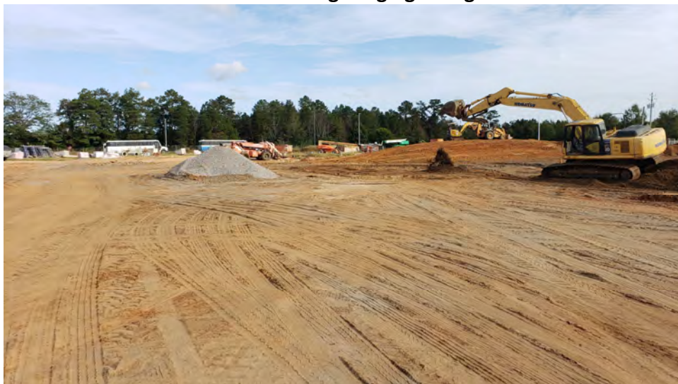
Site – Parking rough grading