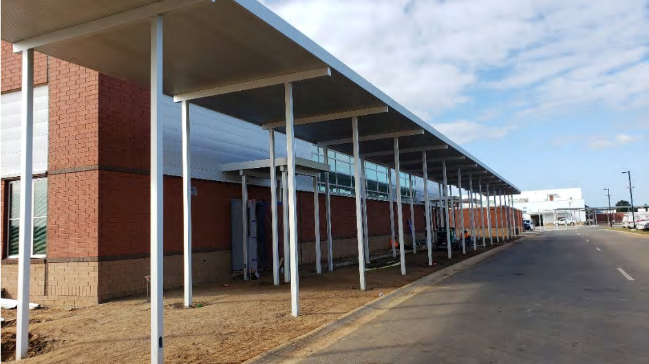
Area "C": Physical Education