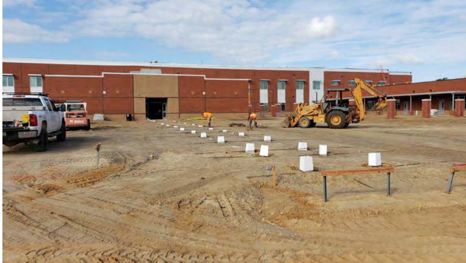
Site – Covered Walkway Foundations