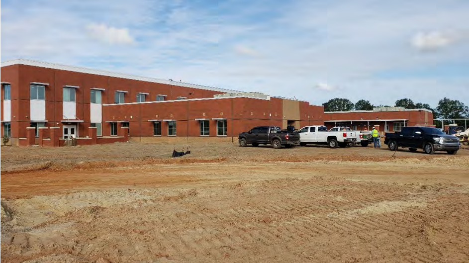
Area "A": Classroom Addition