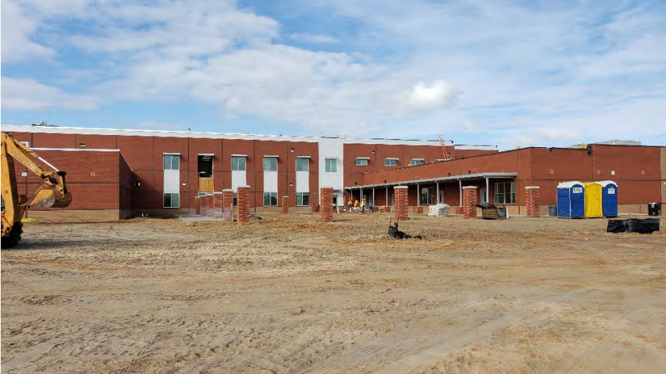
Area "B": Classroom Addition and Kindergarten Wing