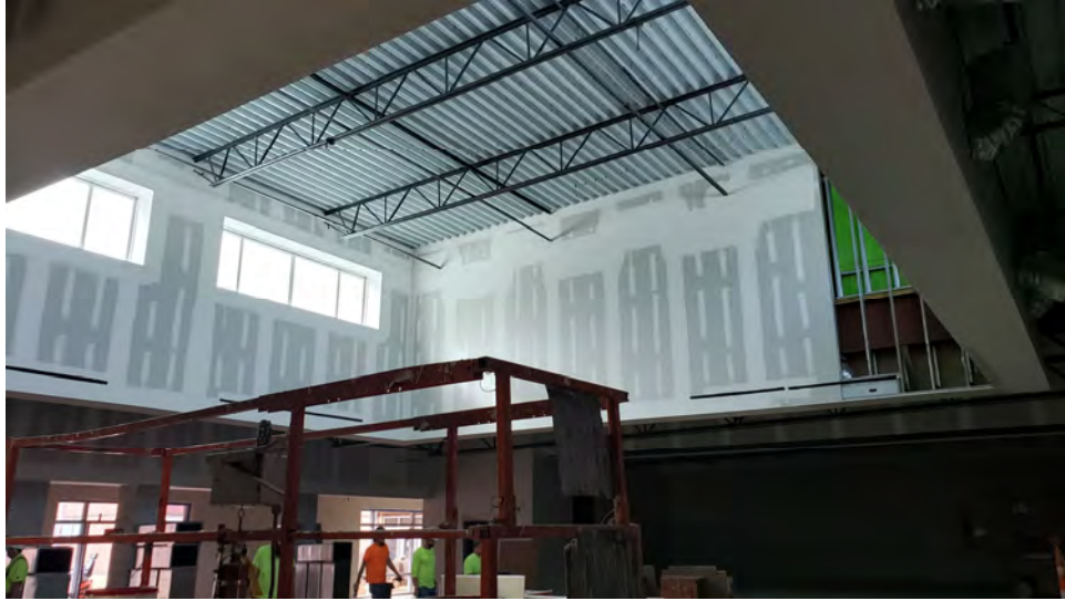
Area "C": Dining Area and Platform