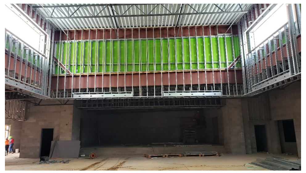
Area "C": Dining Area and Platform