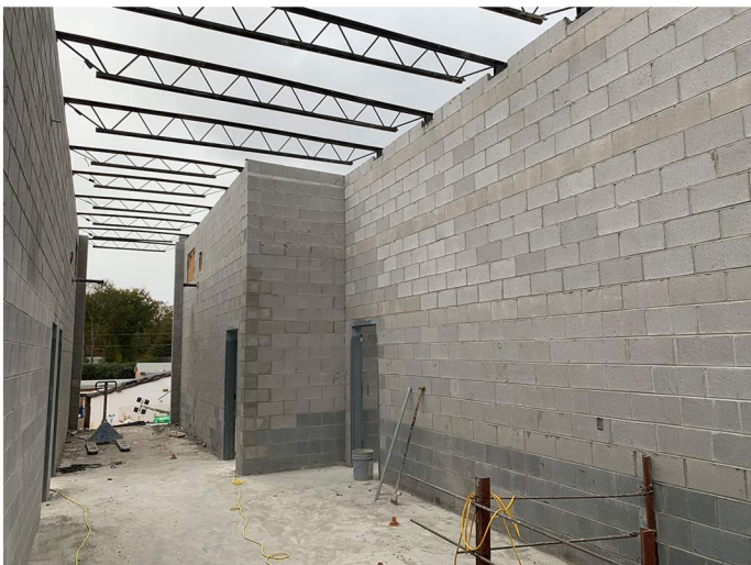
Second floor construction progress.