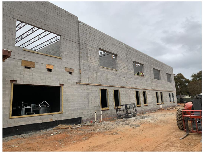
South elevation facing East Pine Log Road.