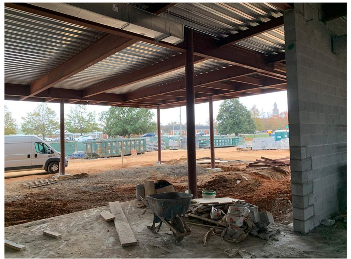
View from new administration area looking toward covered entry.