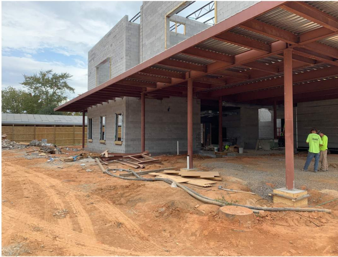
Exterior view of main entry.