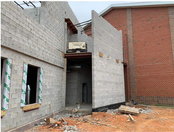
Exterior view of connector to existing two-story building.