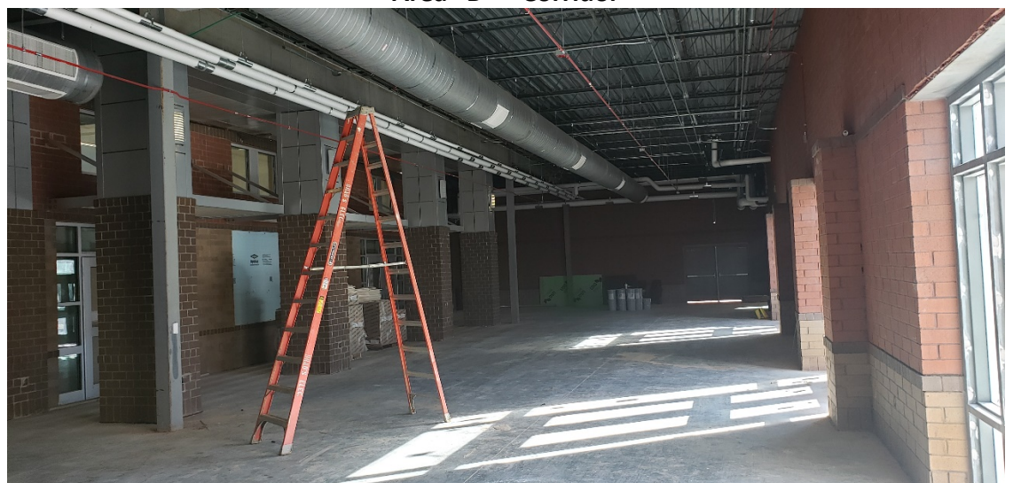
Area "C" – Cafeteria Expansion