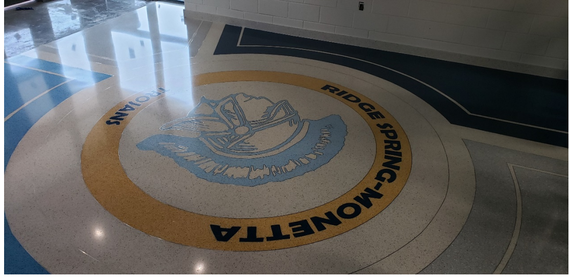
Area "A" – Main Entry Terrazzo Floor