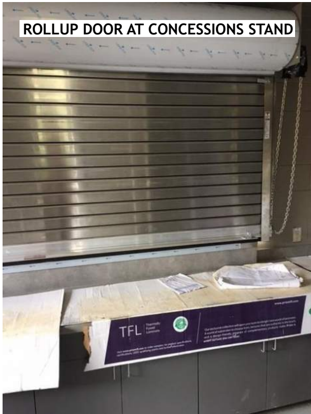
ROLLUP DOOR AT CONCESSIONS STAND