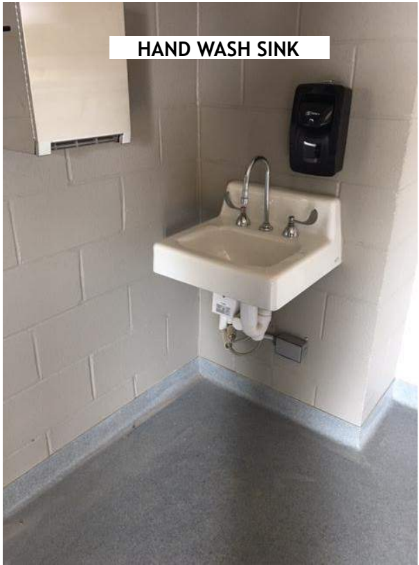
HAND WASH SINK