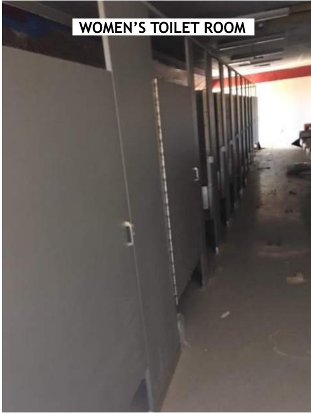
WOMEN'S TOILET ROOM