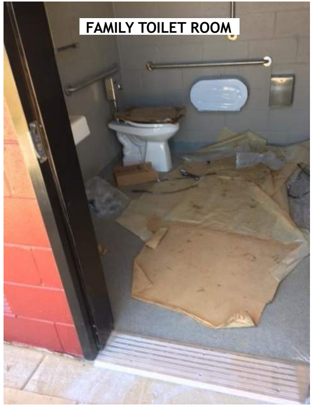
FAMILY TOILET ROOM