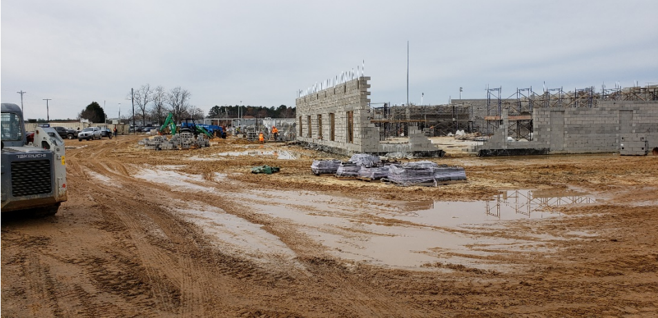
Area "A" CMU walls in-progress