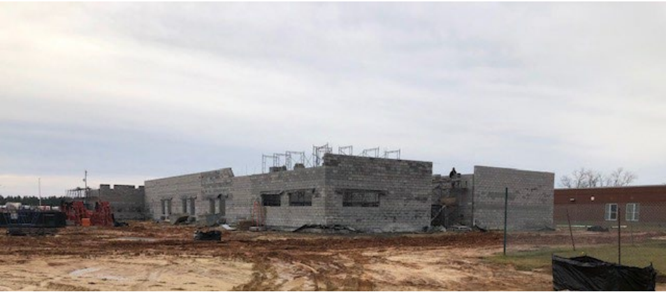
Area "B" CMU walls in-progress