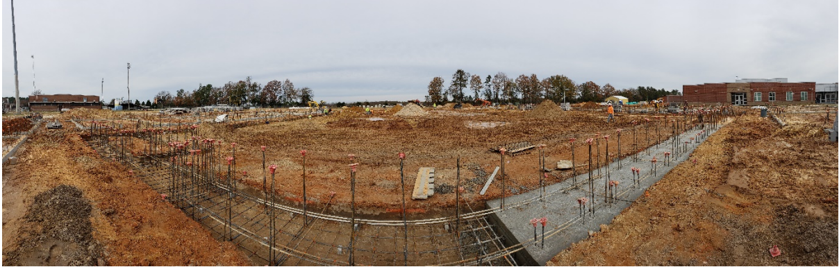
Area "D" Foundations