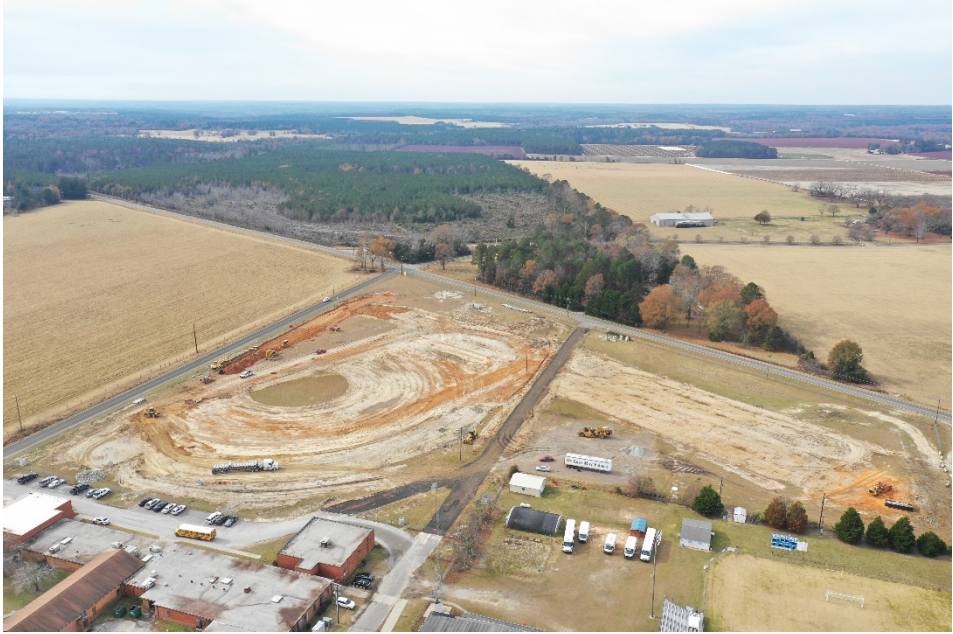
Aerial View at Athletic Fields