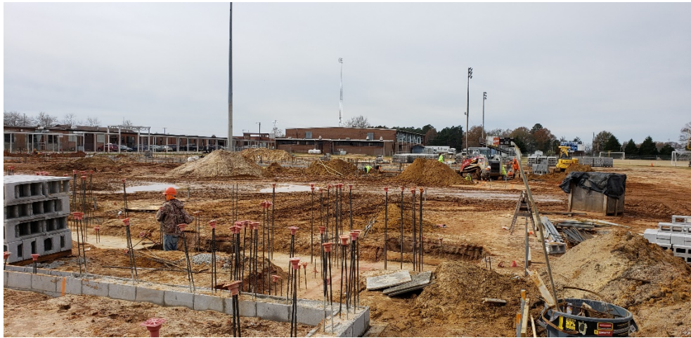
Area "D" Foundations