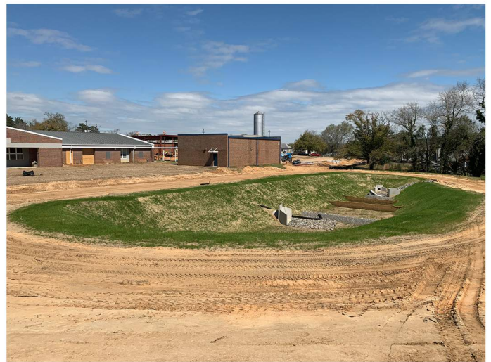
New stacking drive and drainage pond.