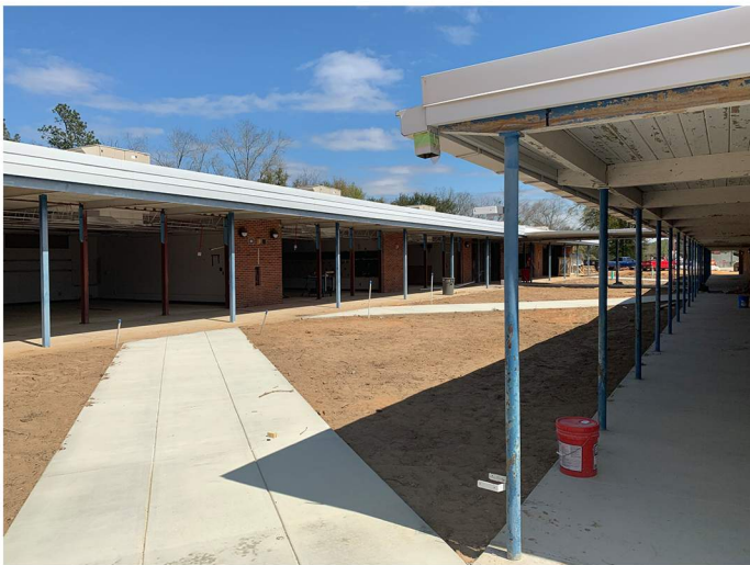
New concrete sidewalks in courtyard between Area 1 and Area 2.