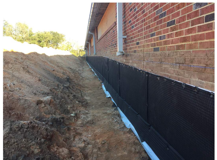
New waterproofing in progress at Area 1.