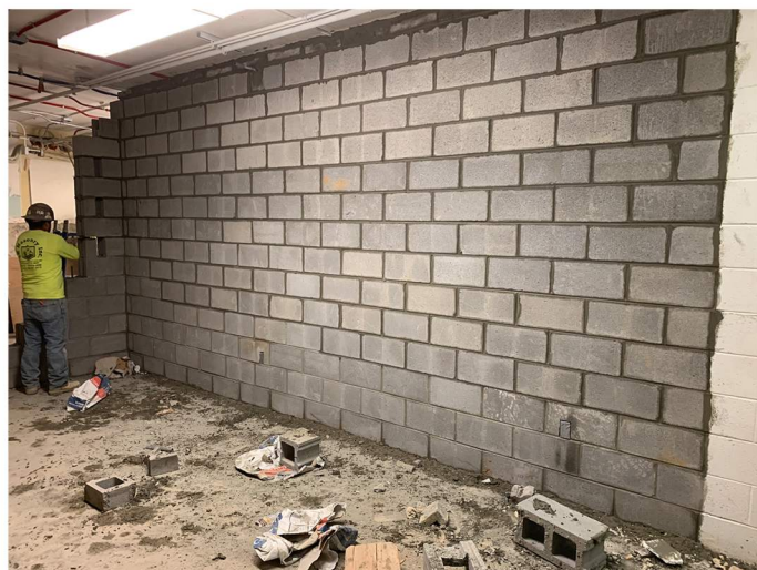
New CMU wall construction.