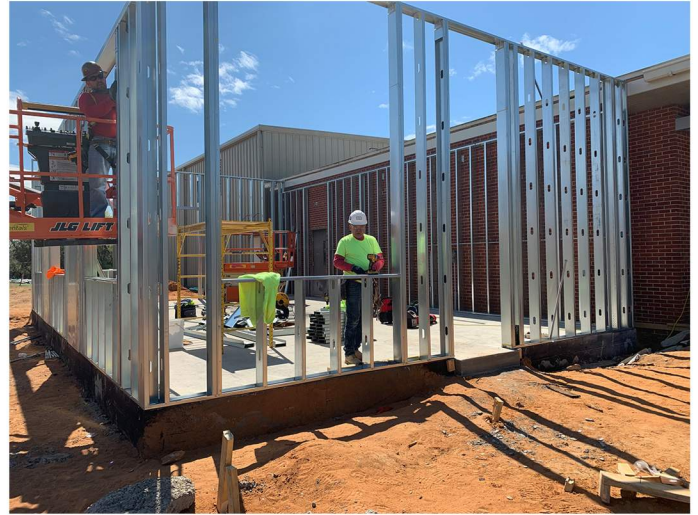
Metal stud framing is in progress at the administration addition.