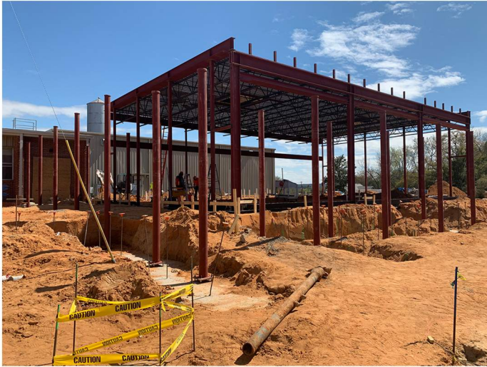
Steel framing in progress at the cafeteria addition.