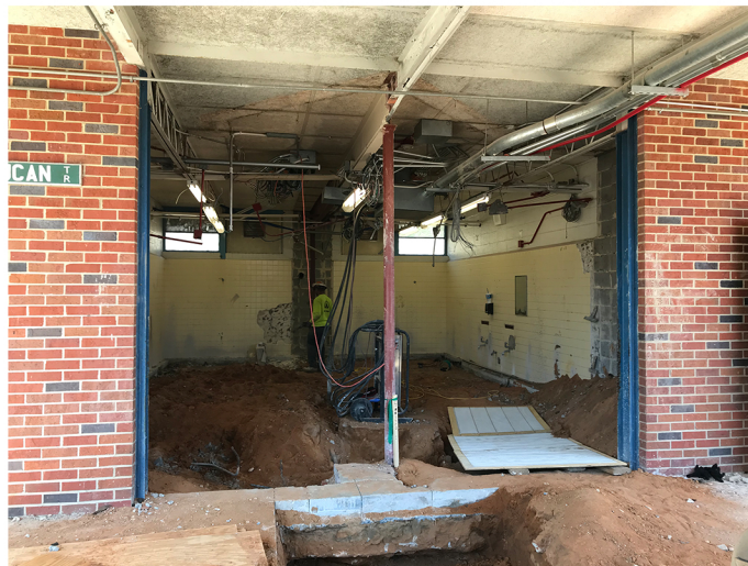
EXISTING RESTROOMS HAVE BEEN DEMOLISHED