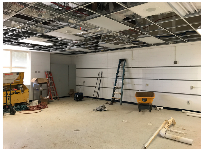
GENERAL BUILDING DEMOLITION IS UNDERWAY