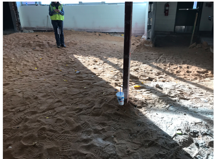
EXISTING KITCHEN HAS BEEN DEMOLISHED