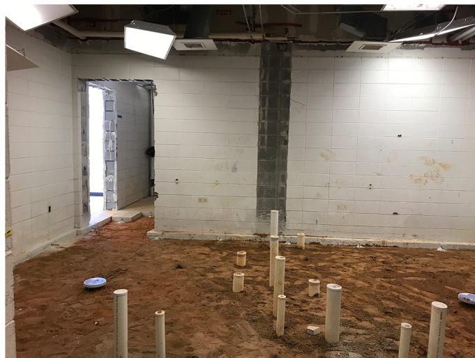
NEW PLUMBING IS BEING INSTALLED