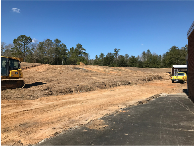
SITE GRADING UNDERWAY