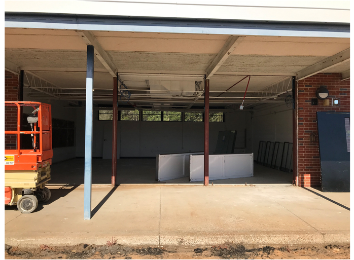
EXISTING WINDOWS HAVE BEEN REMOVED