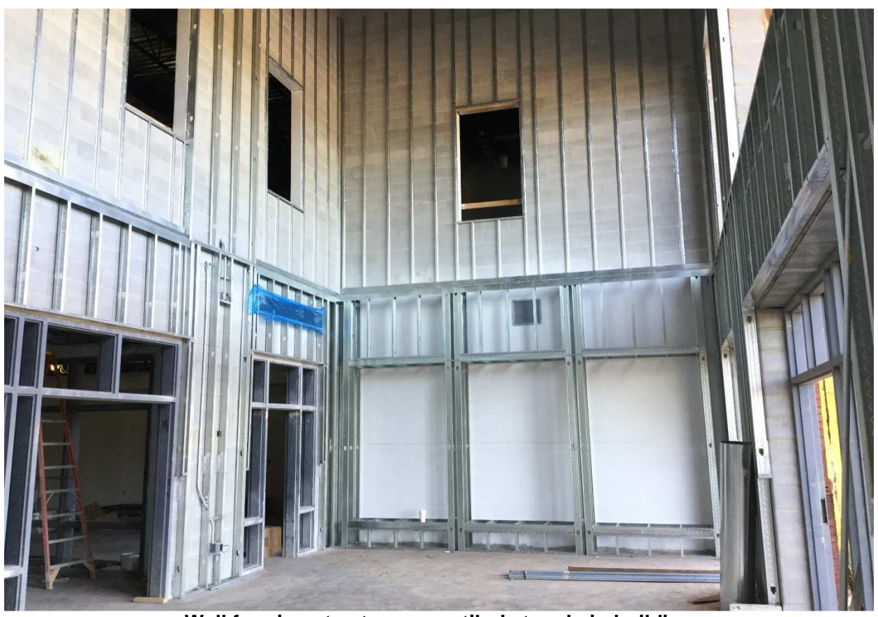
Wall framing at entrance vestibule to admin building