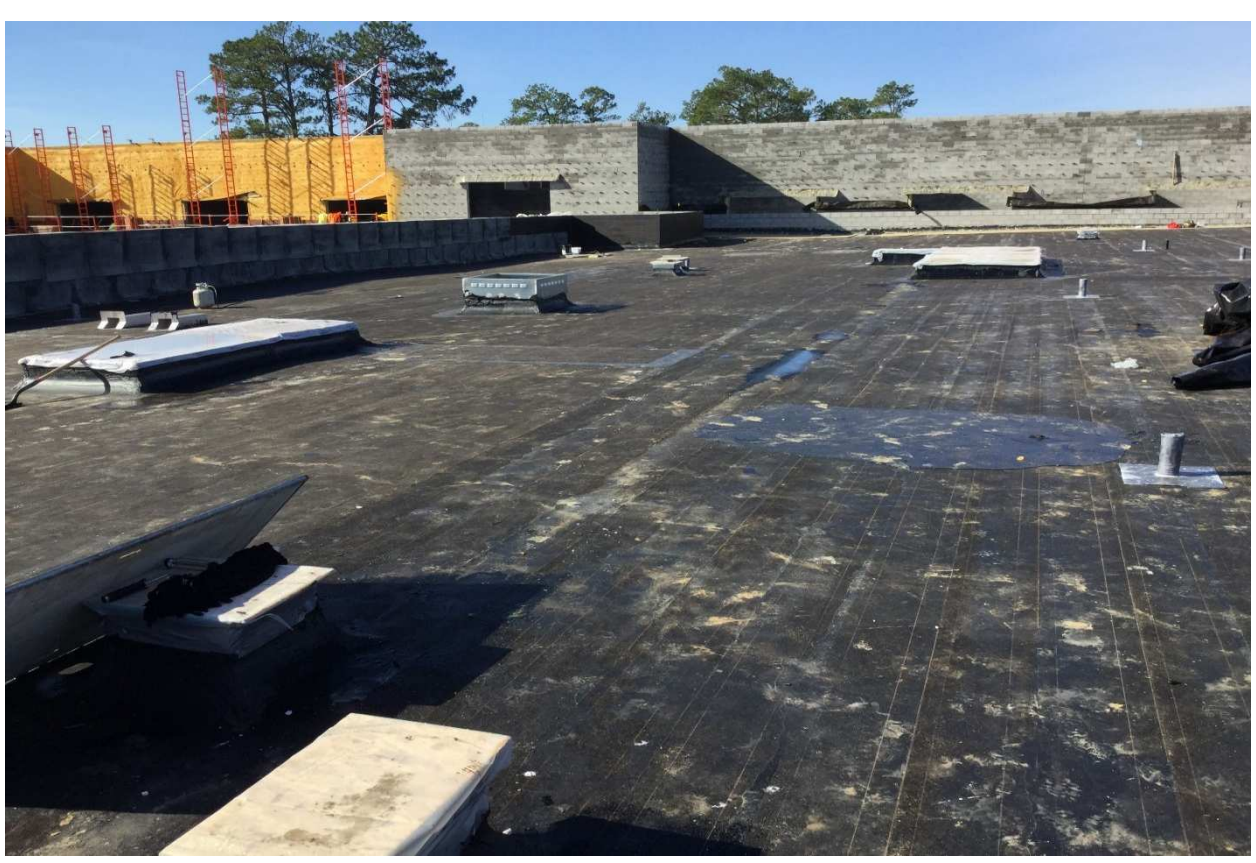
Roof dry-in above cafeteria