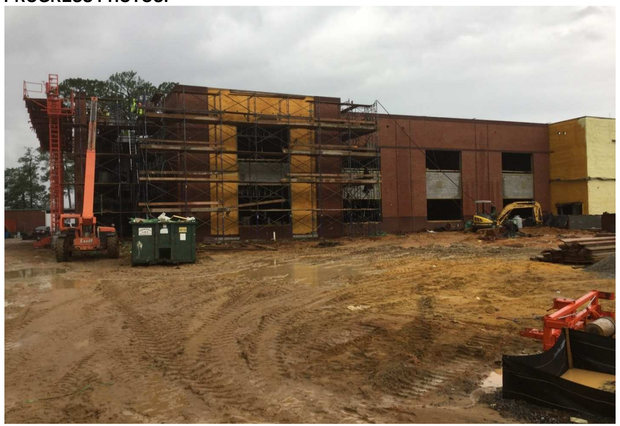
Brick veneer at front classroom wing