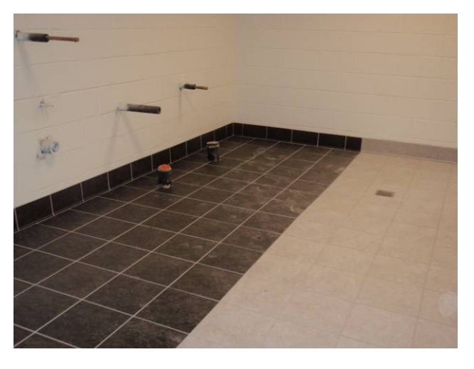
Ceramic tile in Group Toilets