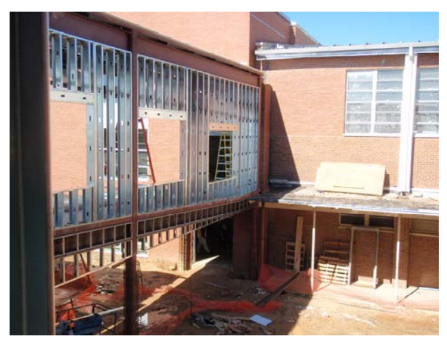
Framing of Connecting Corridor