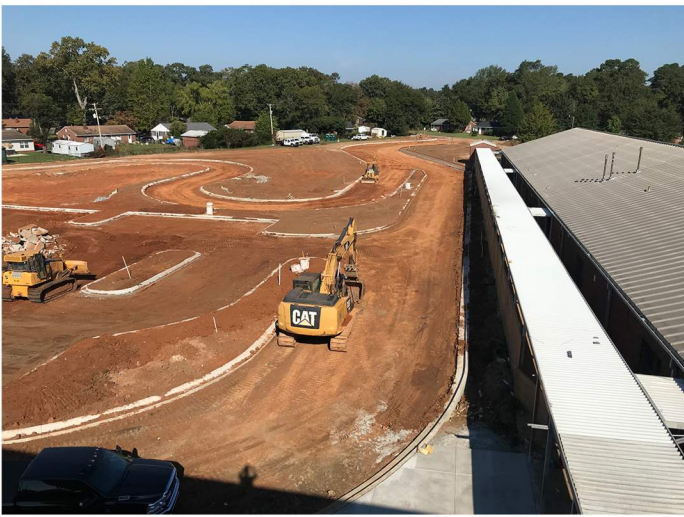
Exterior progress photo. Curb installation is in progress.