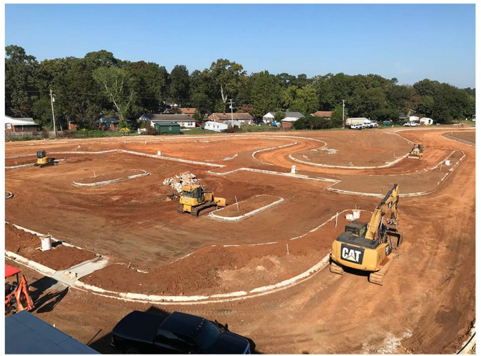
Exterior progress photo. Curb installation is in progress.