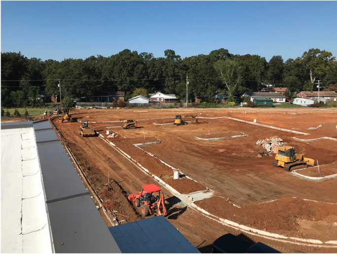
Exterior progress photo. Curb installation is in progress.