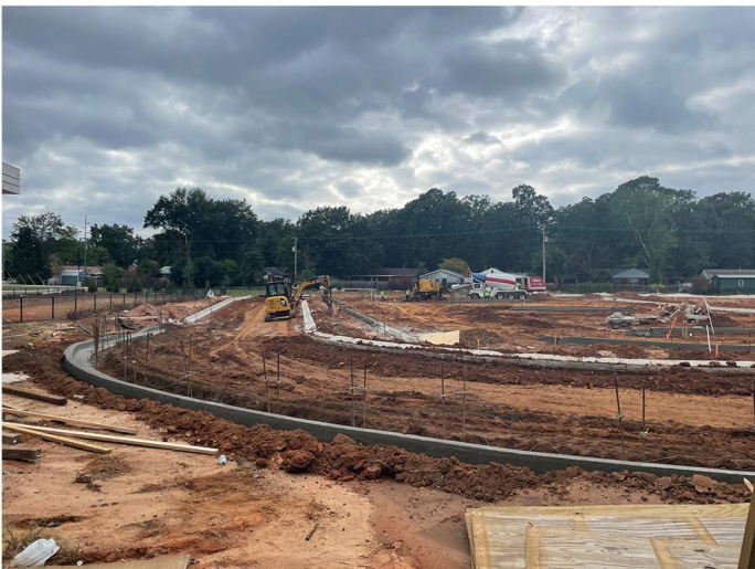
Exterior progress photo.