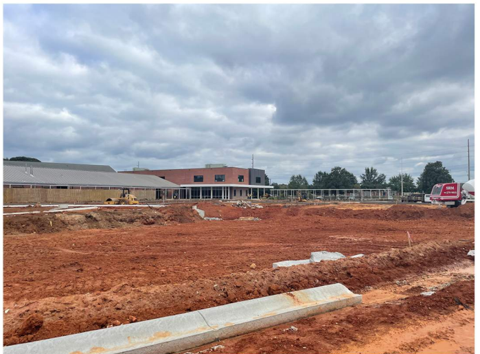
Exterior progress photo.