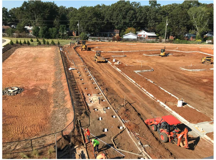
Exterior progress photo. Canopy installation is in progress.