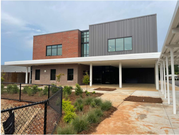
The campus is fully occupied.