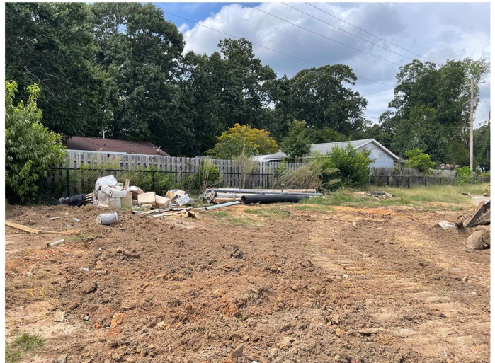
Exterior progress photo.