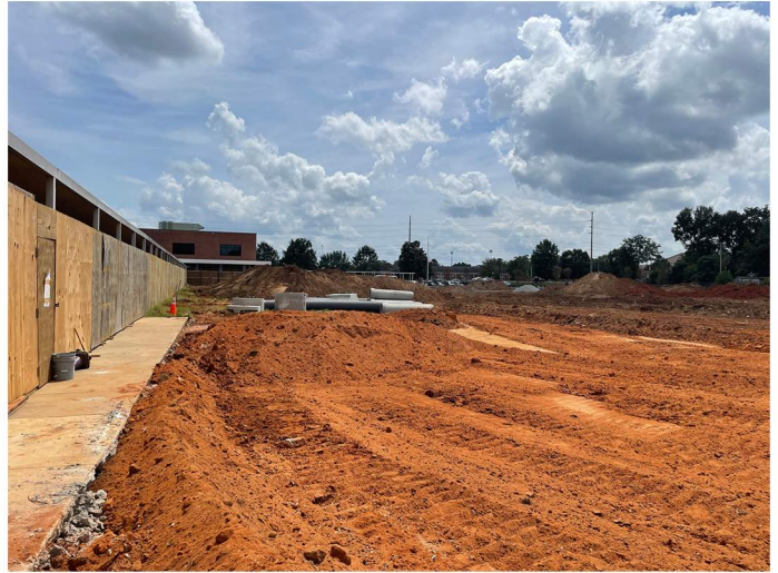
Exterior progress photo.