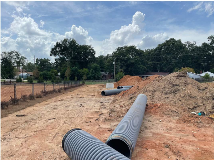
Exterior progress photo.