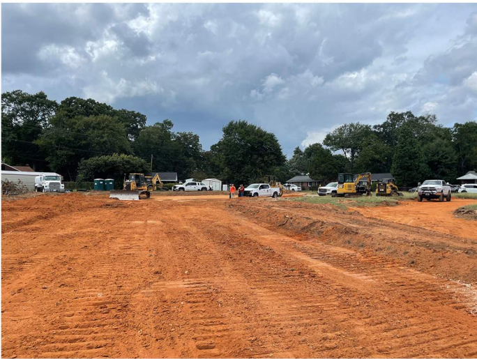
Exterior progress photo.