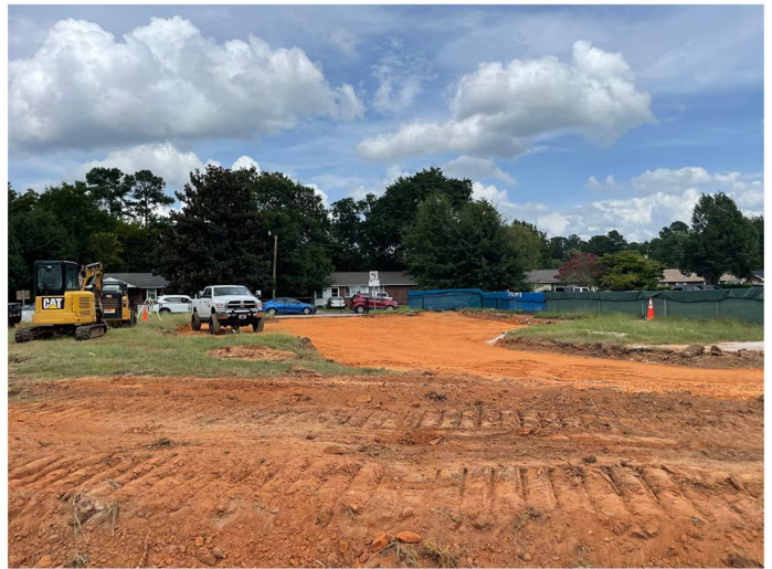
Exterior progress photo.