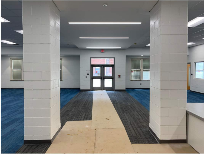
The new media center is complete.