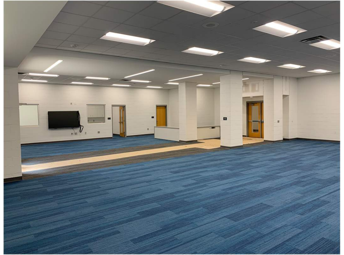
Image of completed media center.