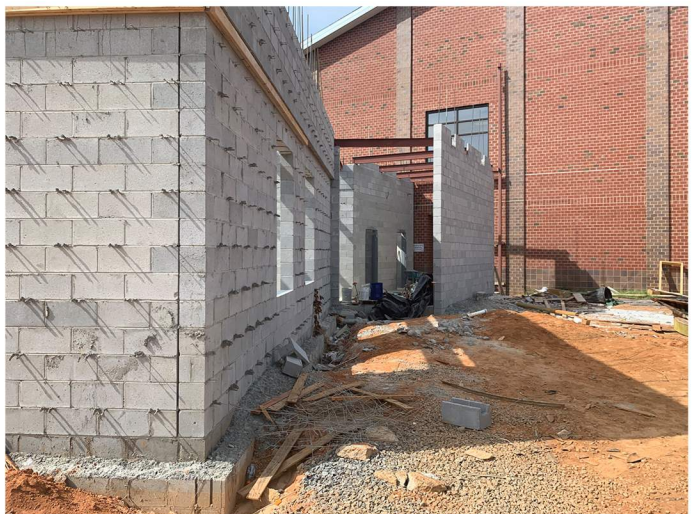
Construction progress at two-story connector.