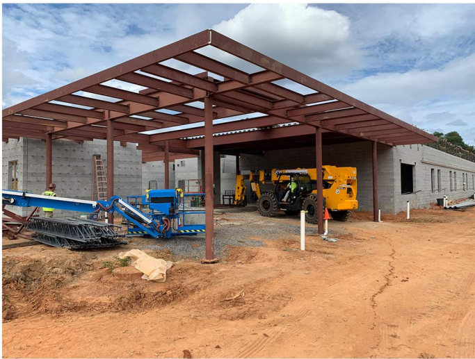
Scnd floor steel framing is in progress.