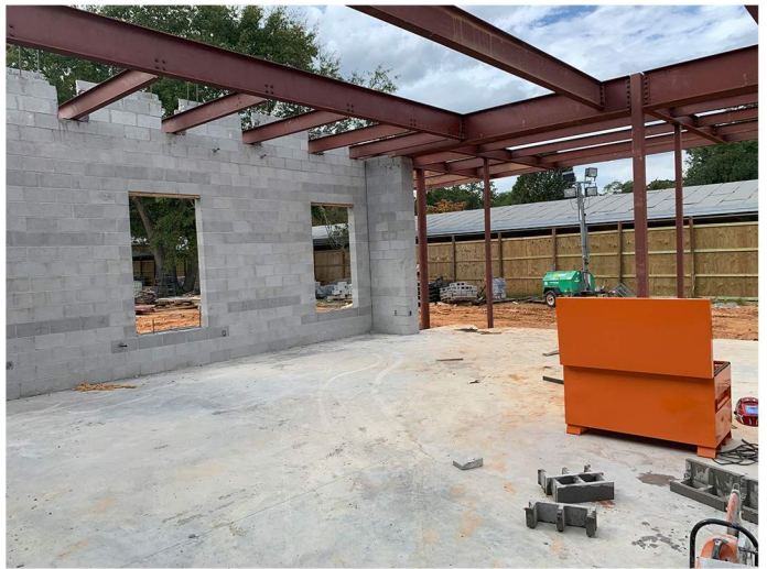
View in future administration area.