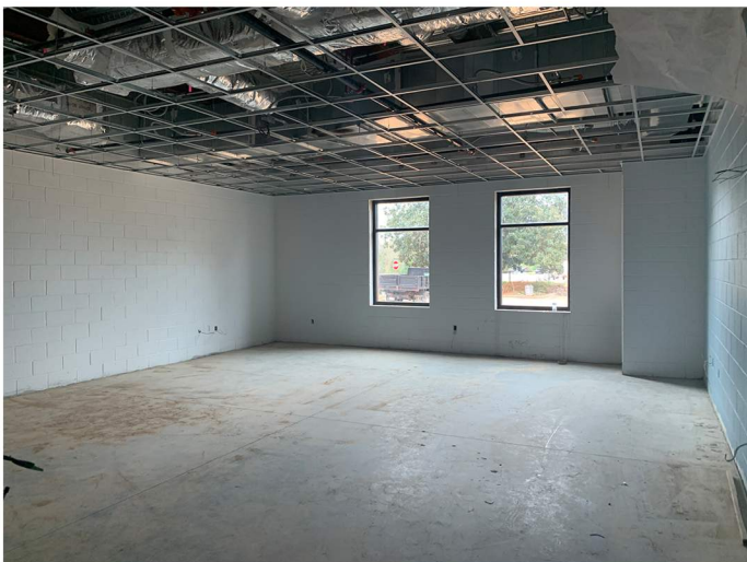
Progress in a typical classroom.