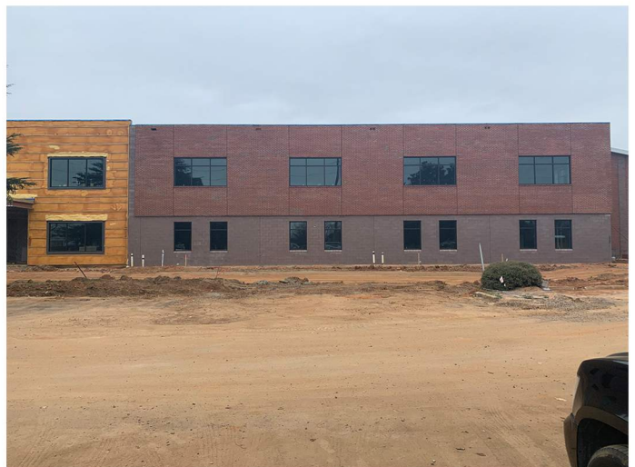
Exterior progress photo.