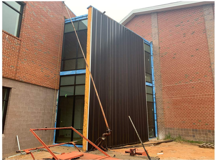
Metal panel installation is in progress.