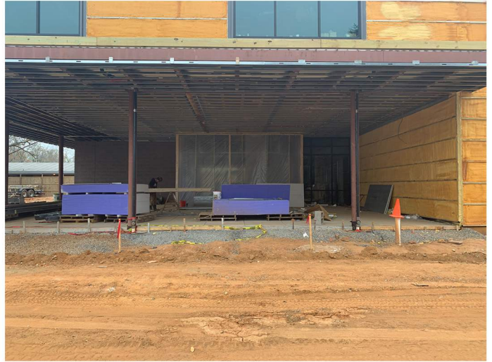
The building is now dried-in.