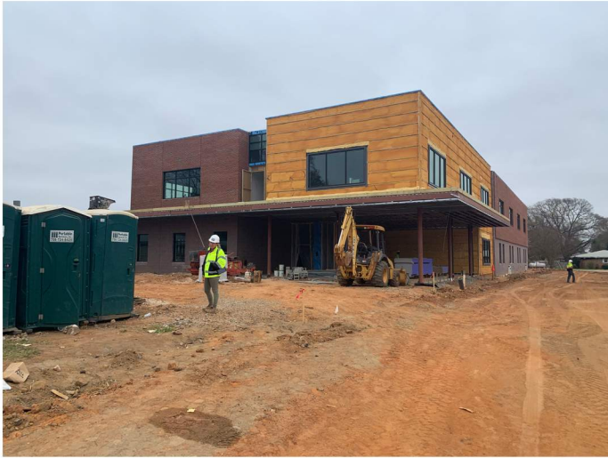
Exterior progress photo.